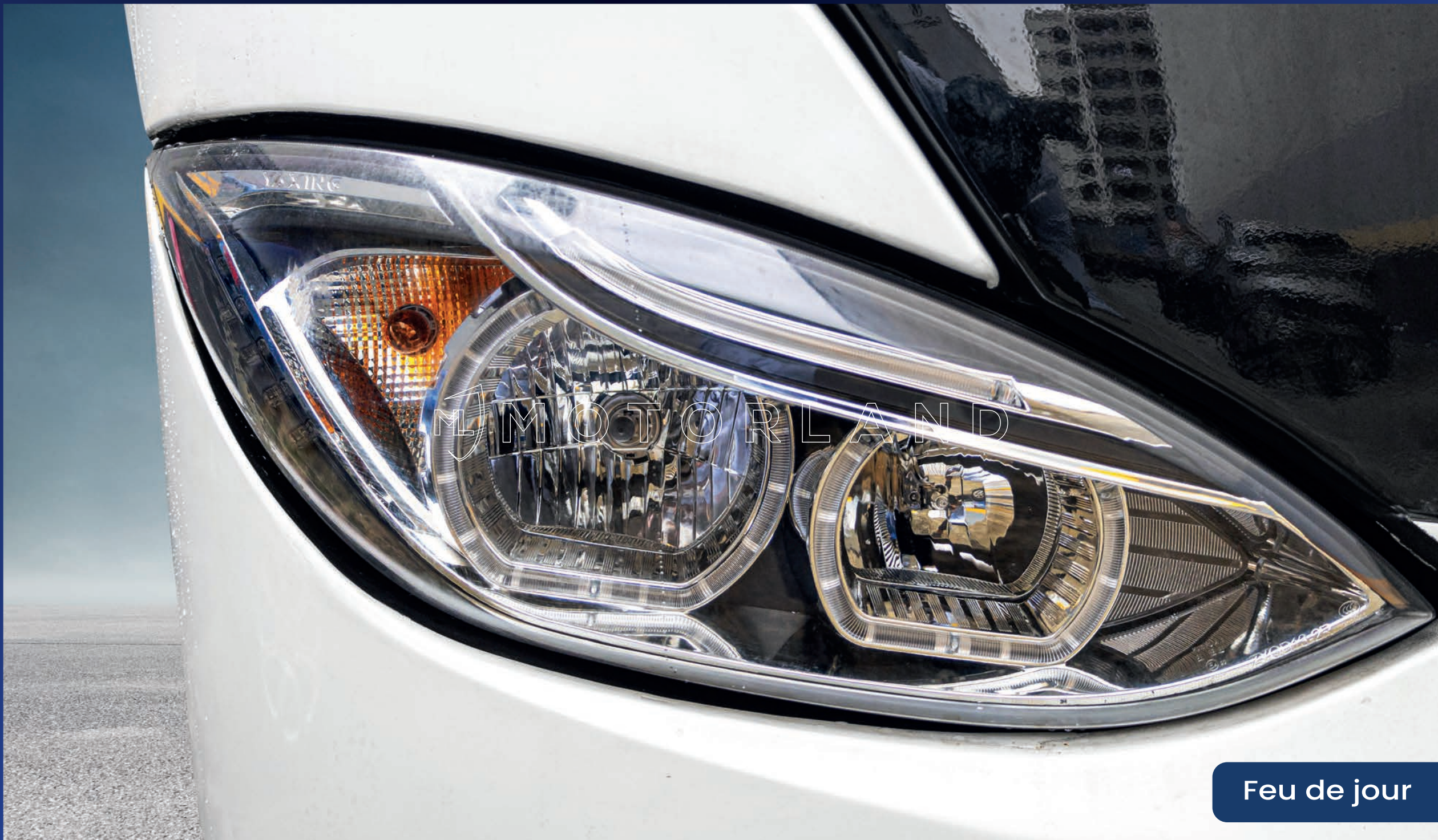
Feu de jour