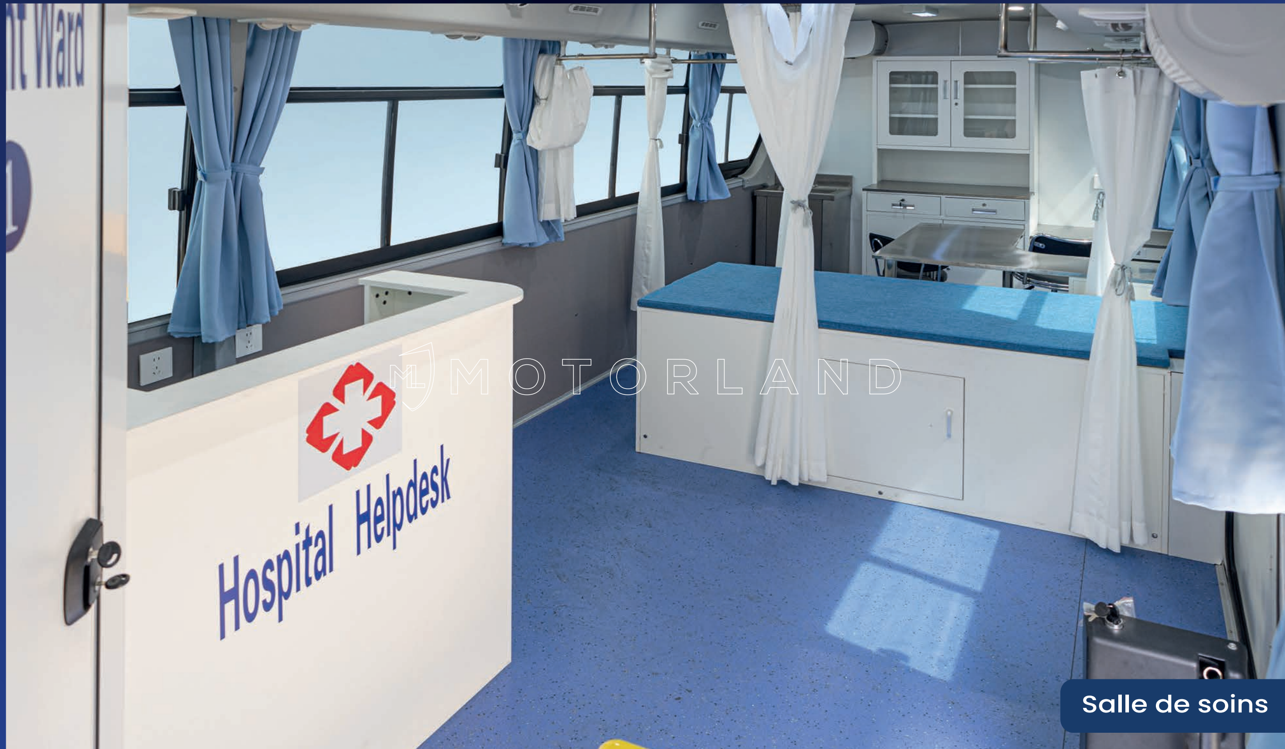
Salle de soins