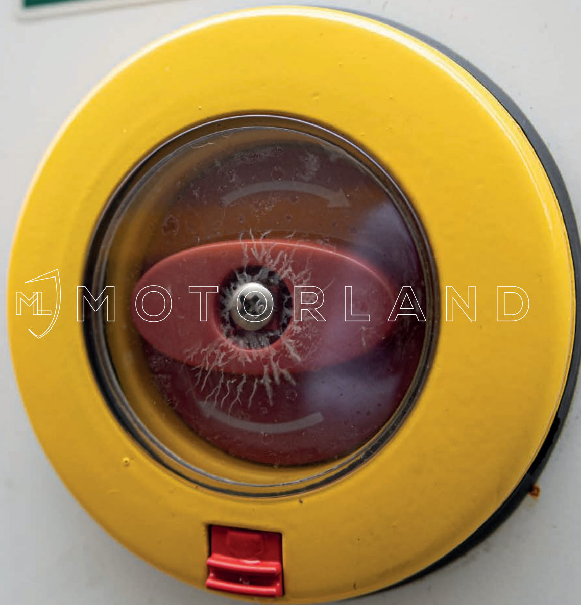
Bouton d'urgence externe