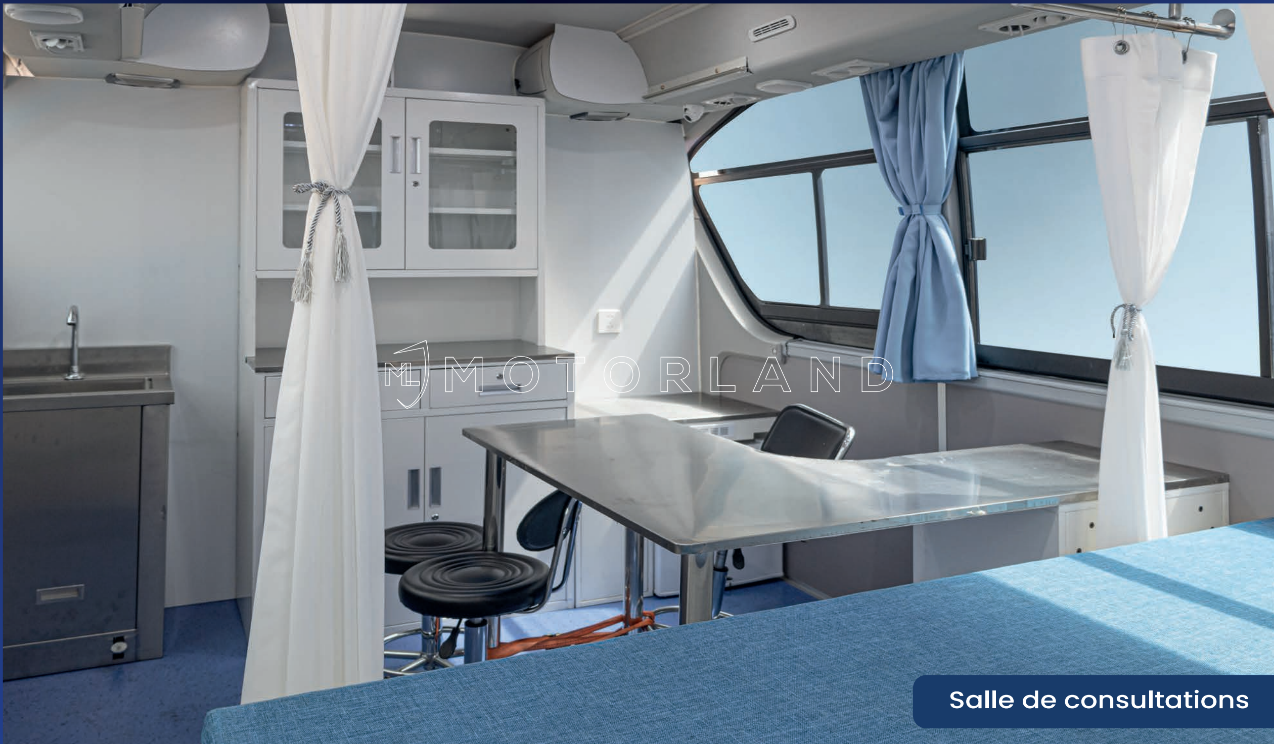
Salle de consultations