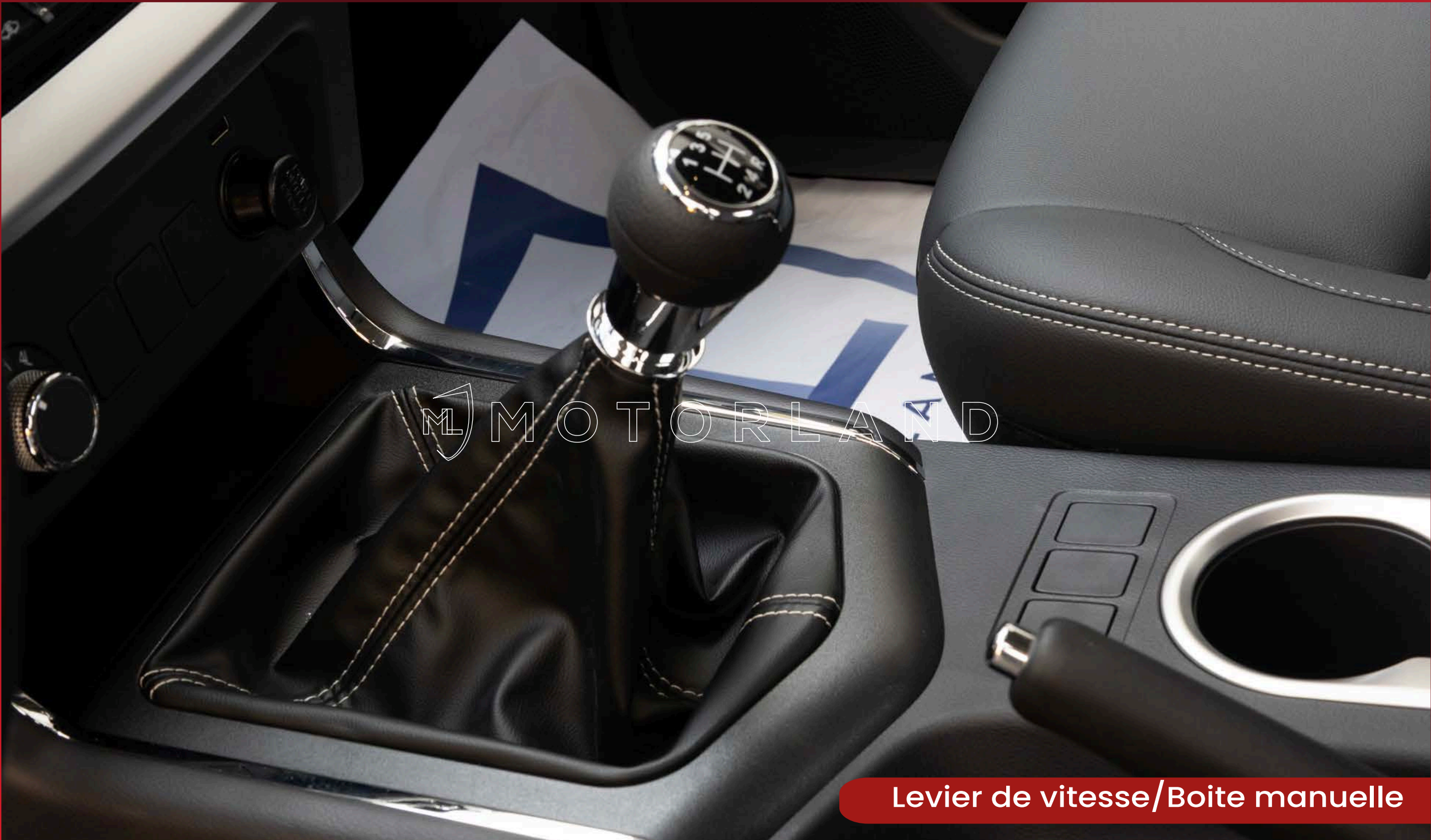
Levier de vitesse/Boite manuelle