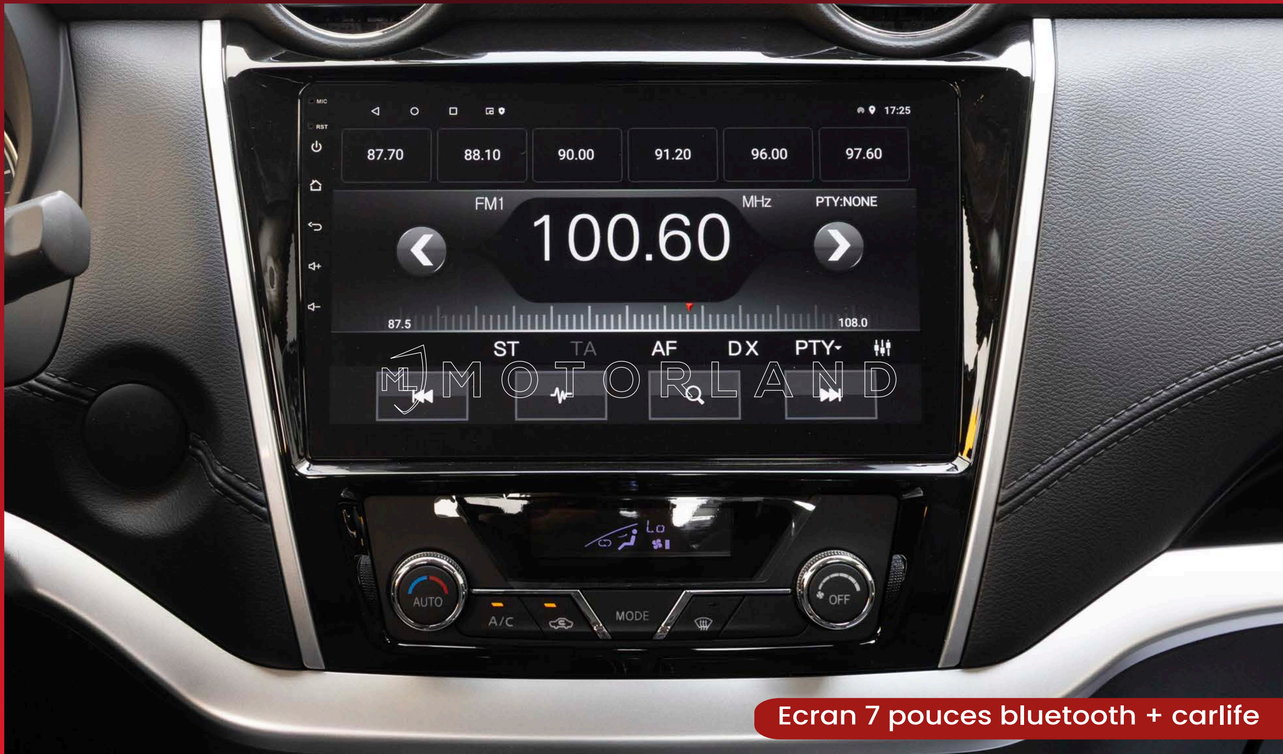
Ecran 7 pouces bluetooth + carlife