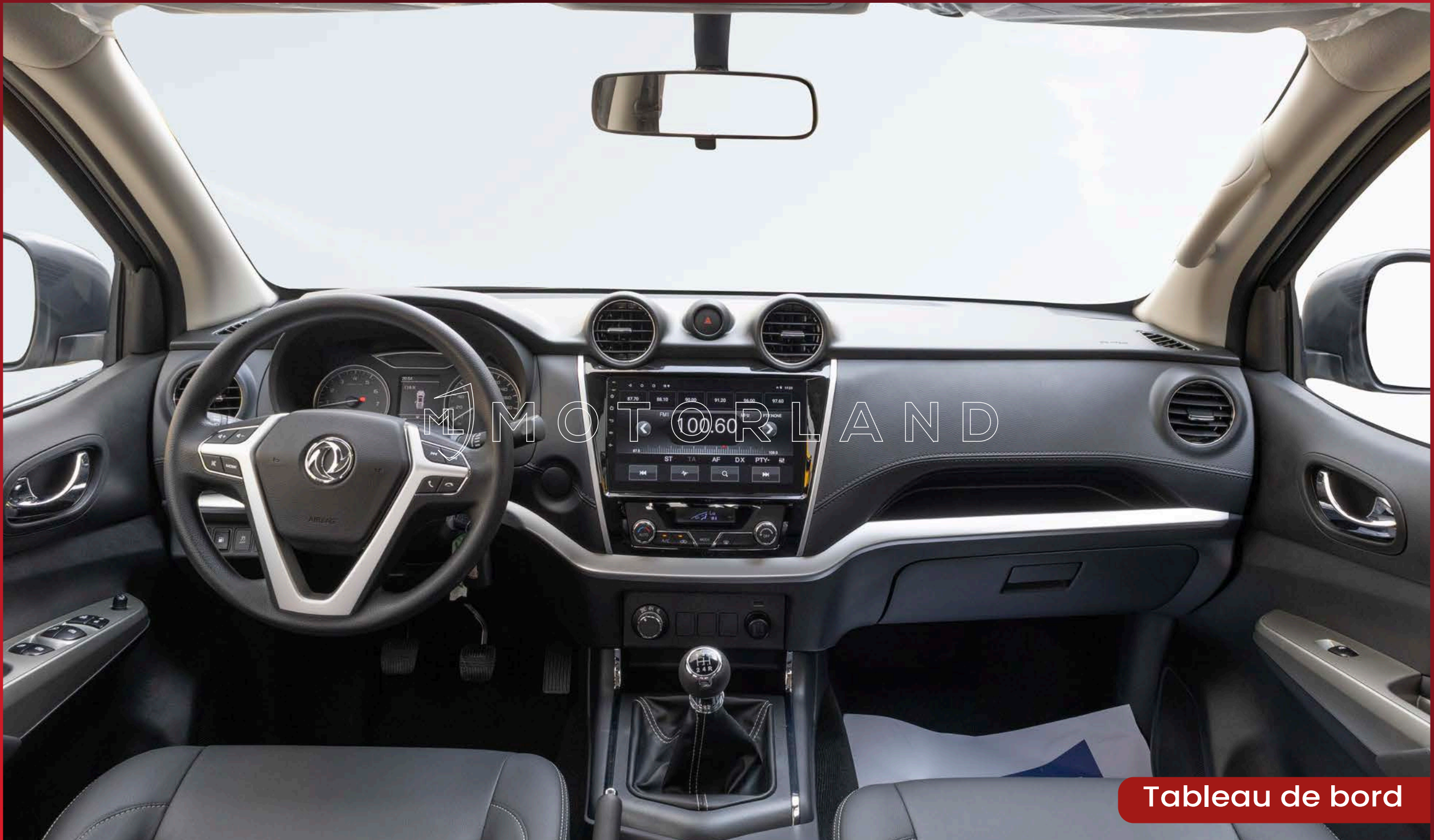
Tableau de bord