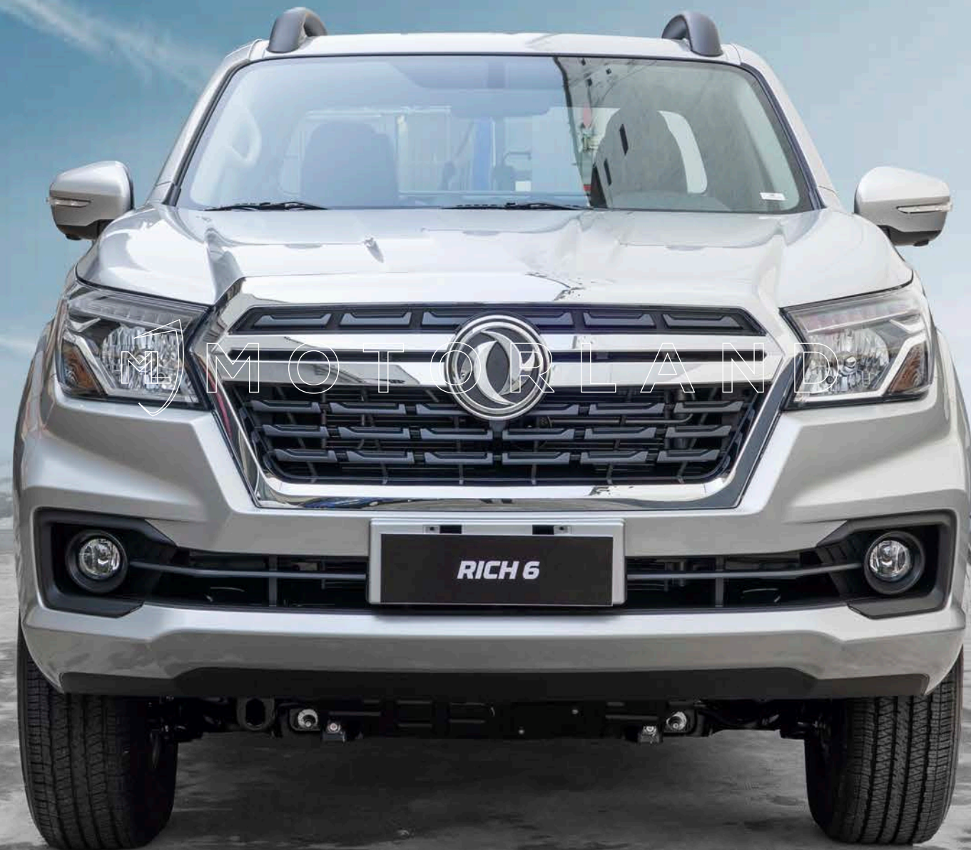
Vue de face