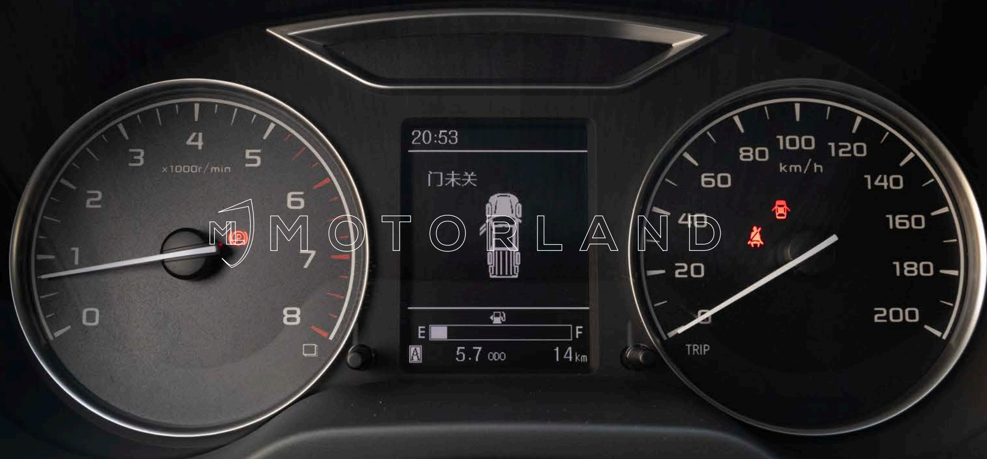
Tableau de bord