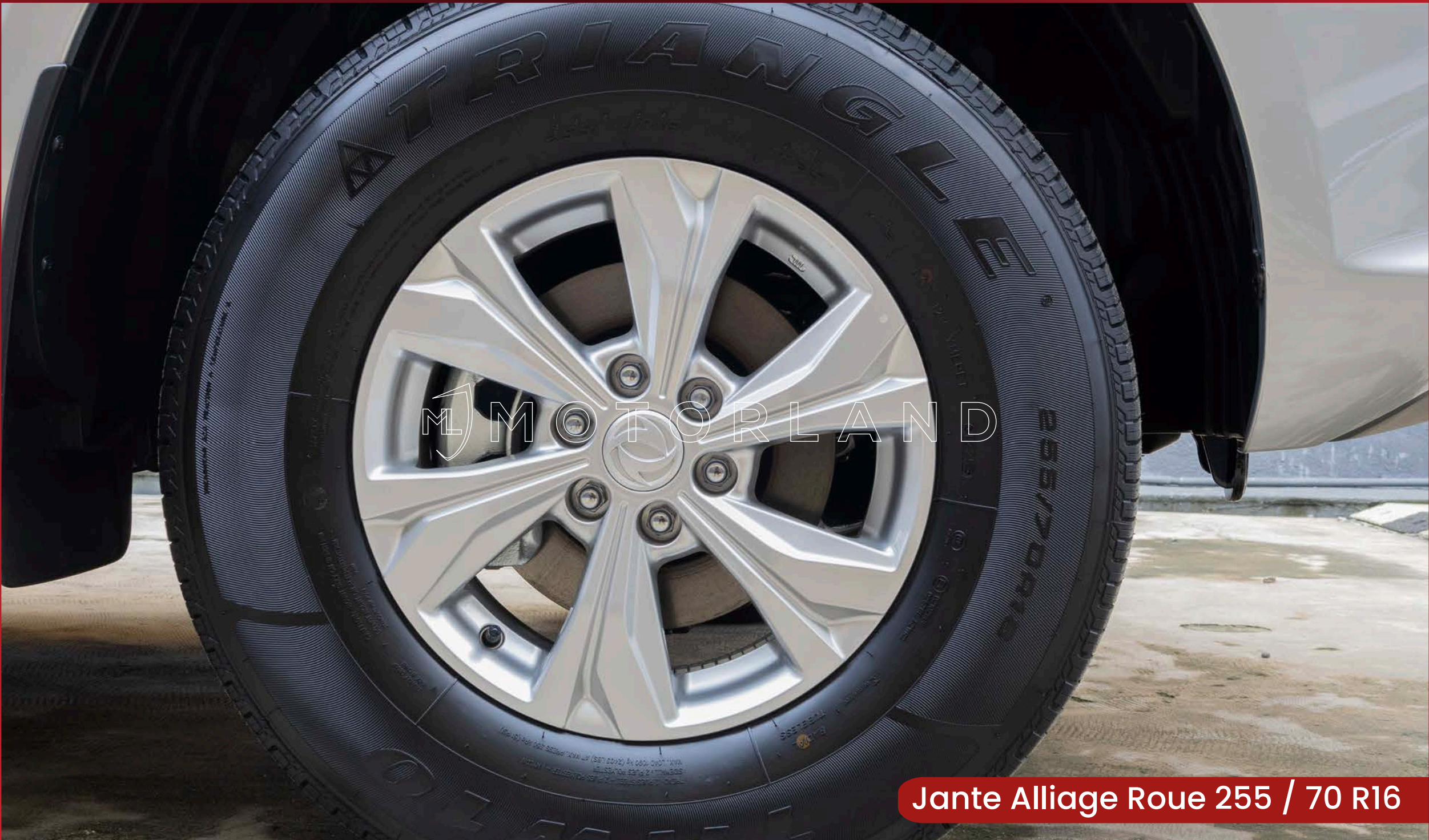
Jante Alliage Roue 255 / 70 R16