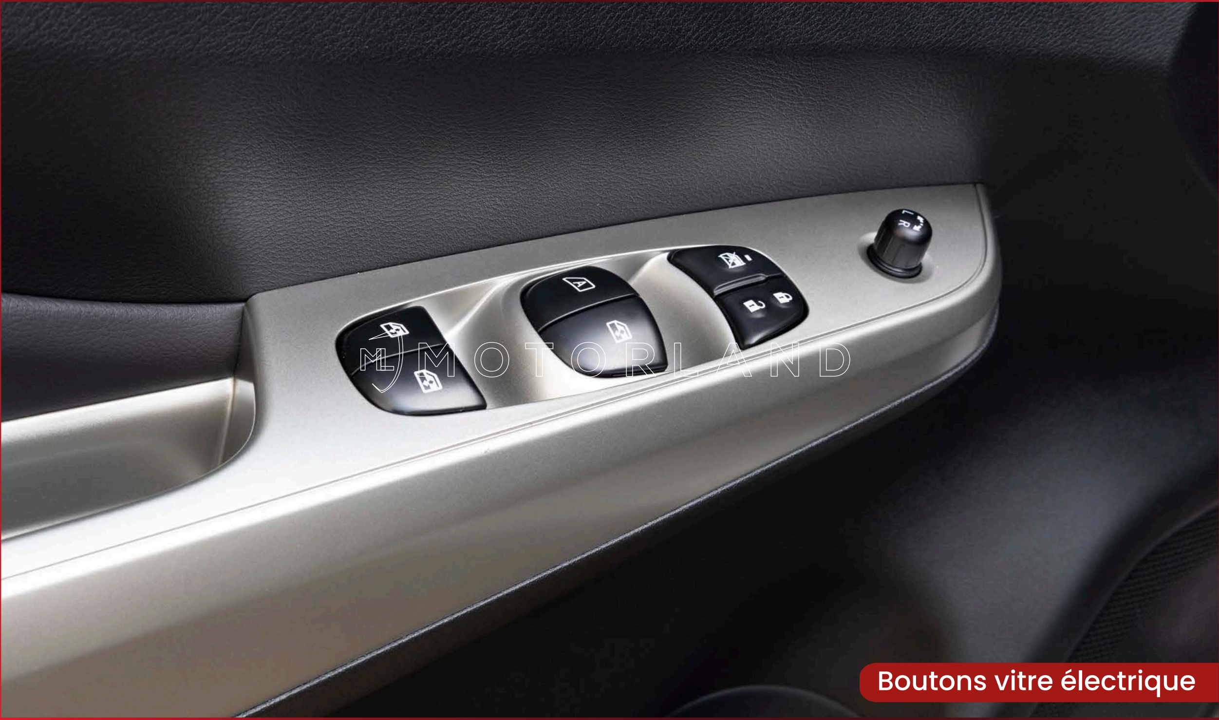
Boutons vitre électrique