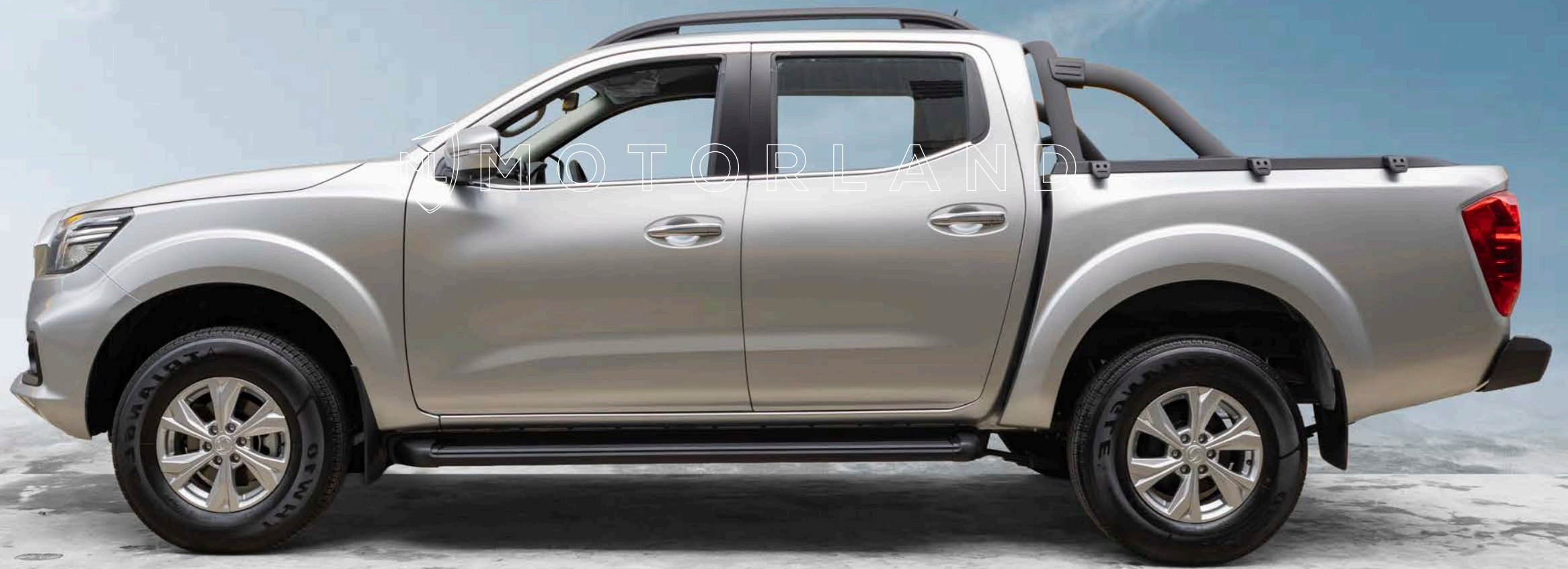
Vue de profil