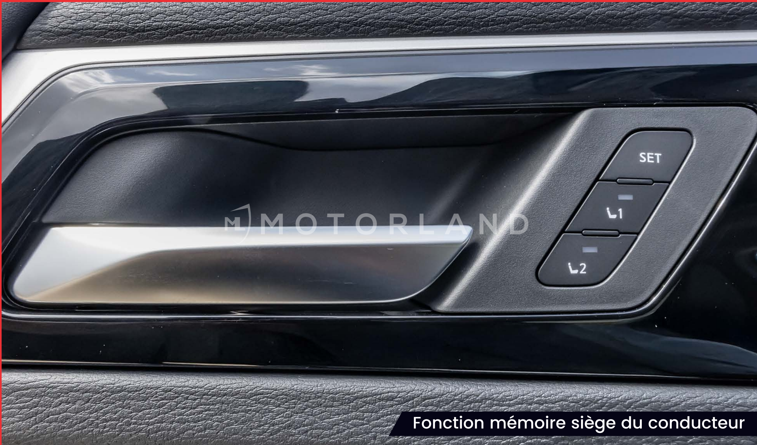
Fonction mémoire siège du conducteur