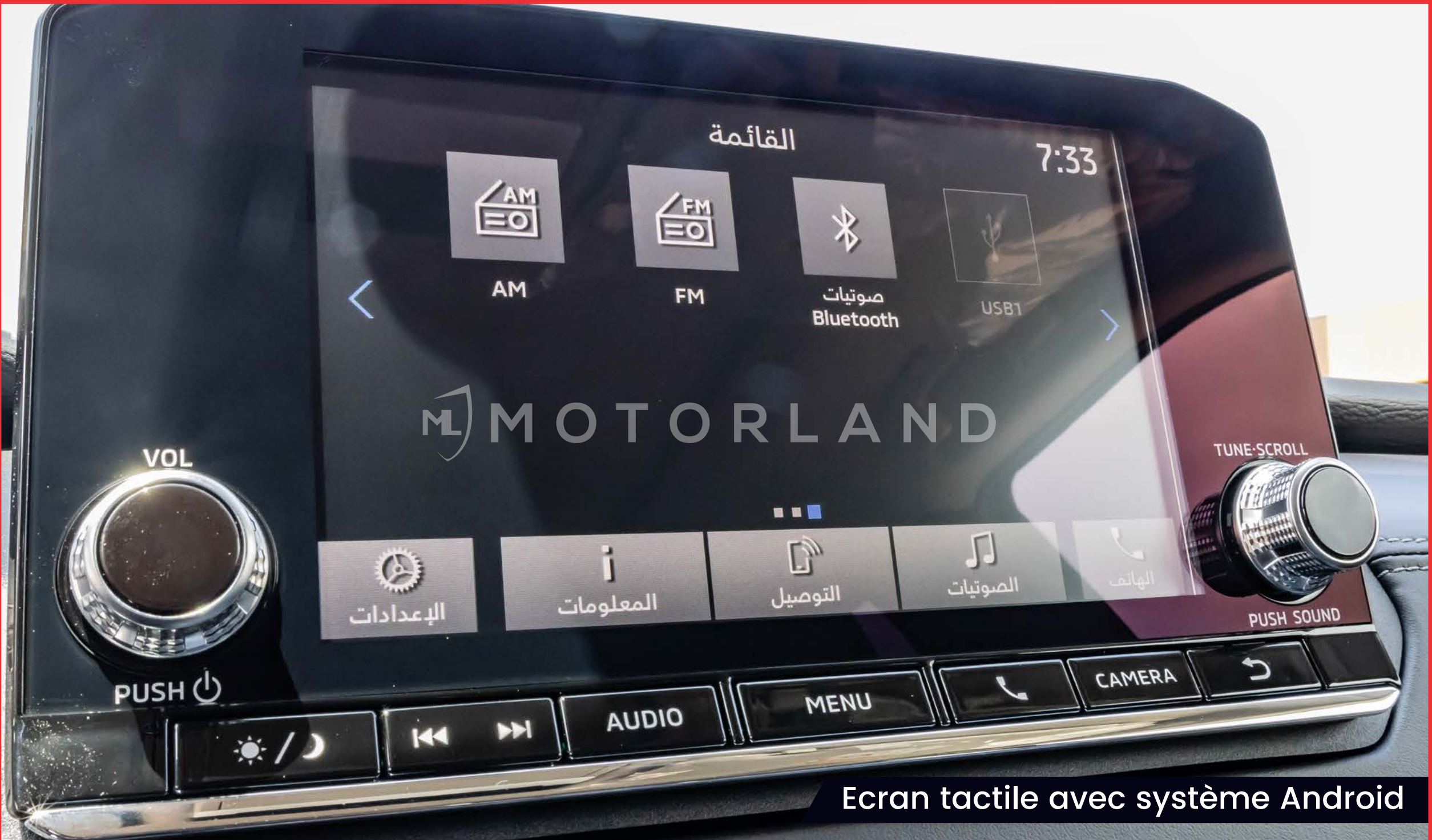
Ecran tactile avec système Android