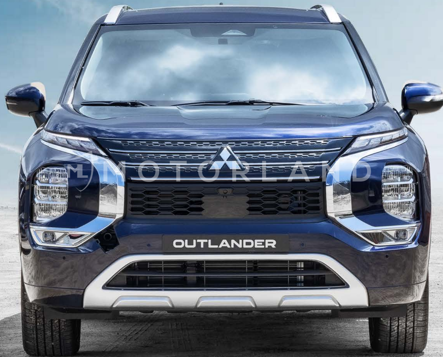
Vue de face