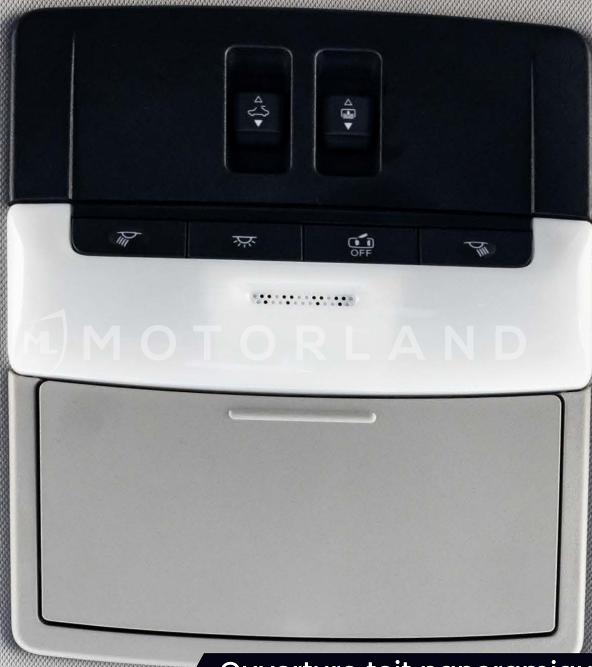
Ouverture toit panoramique + éclairage interne