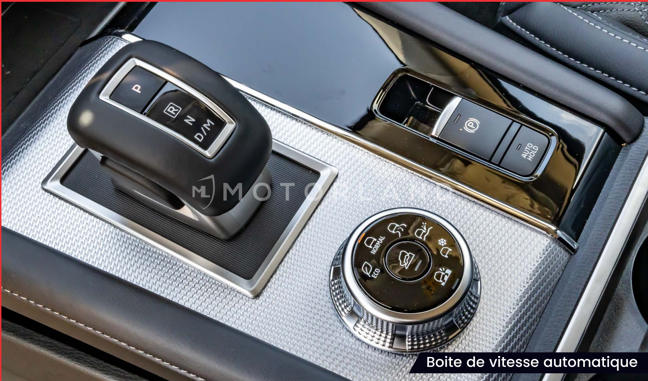
Boite de vitesse automatique