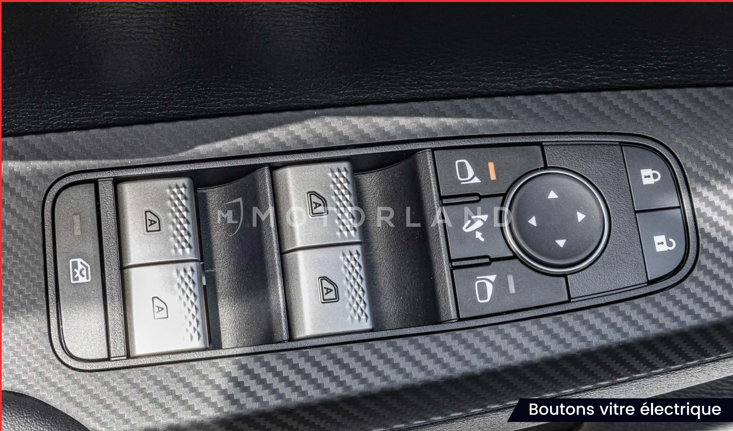
Boutons vitre électrique