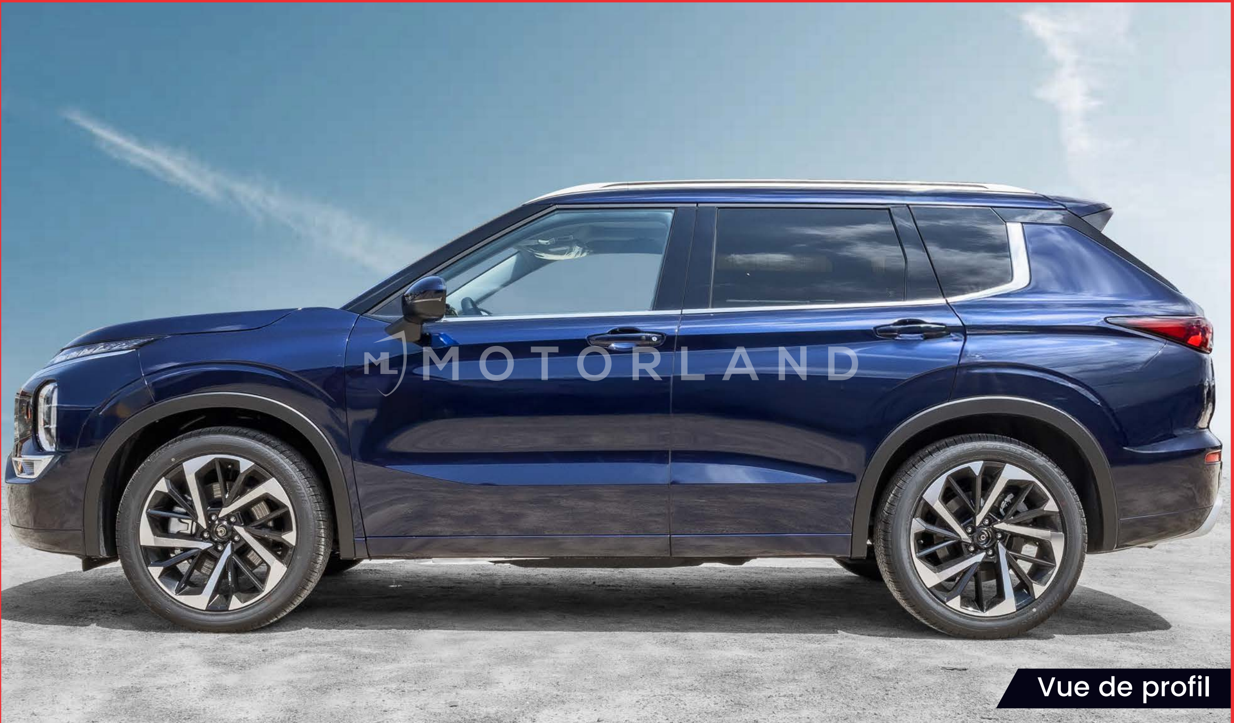
Vue de profil