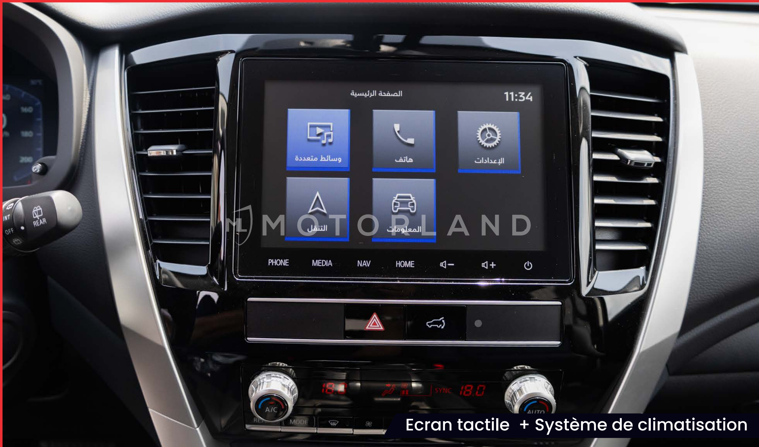
Ecran tactile + Système de climatisation