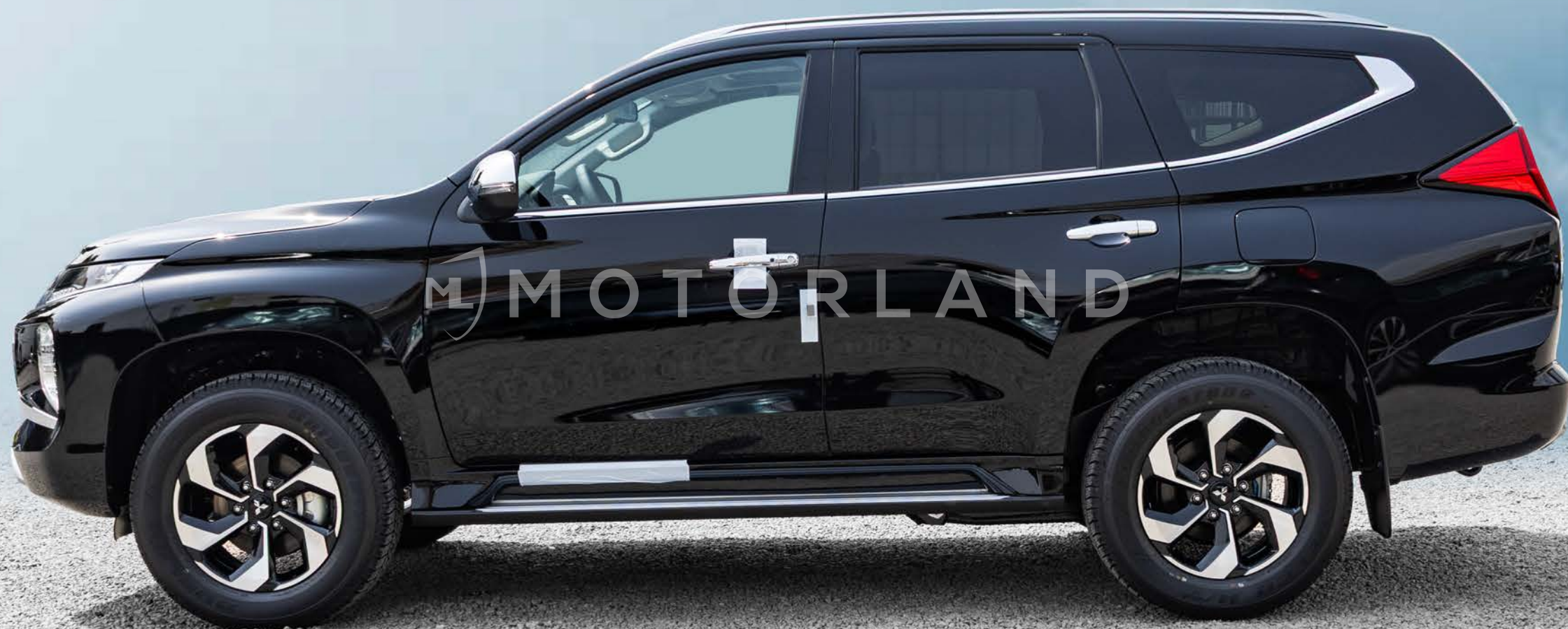
Vue de profil