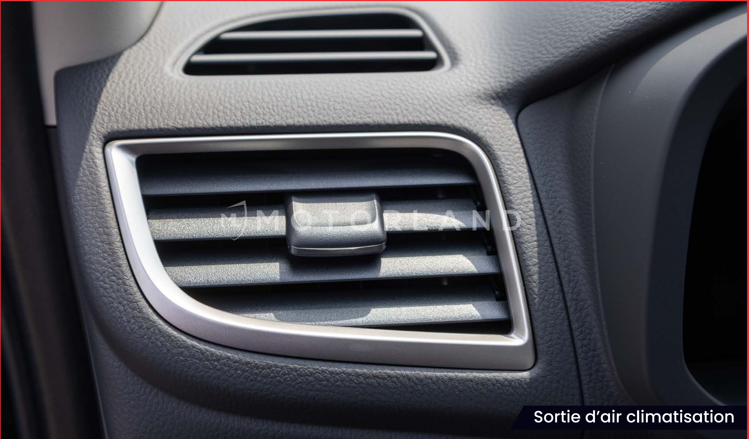
Sortie d'air climatisation