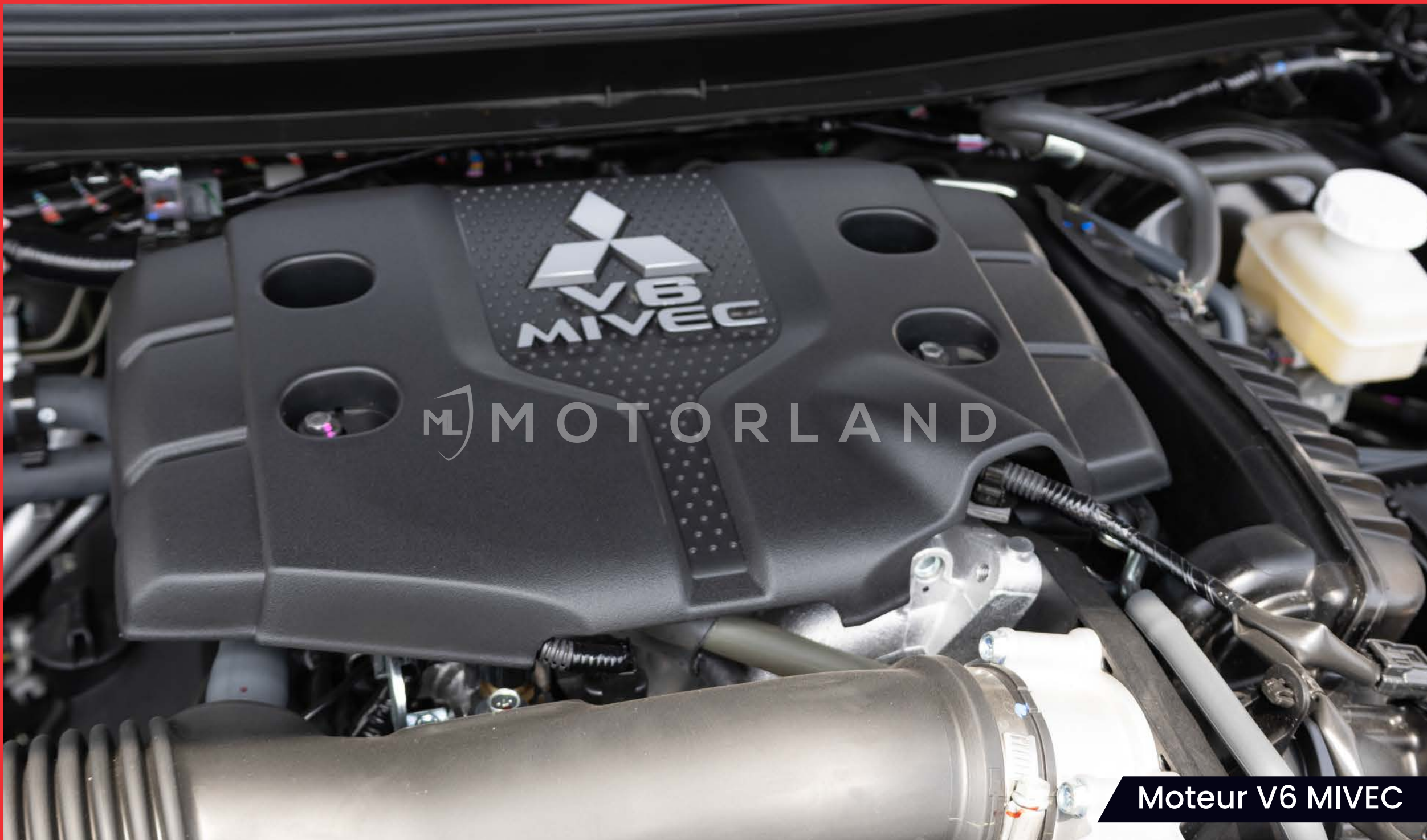
Moteur V6 MIVEC