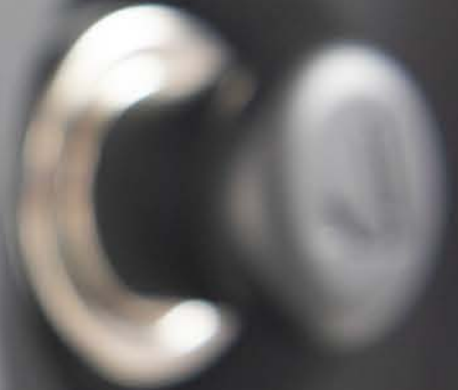
Ports HDMI / USB