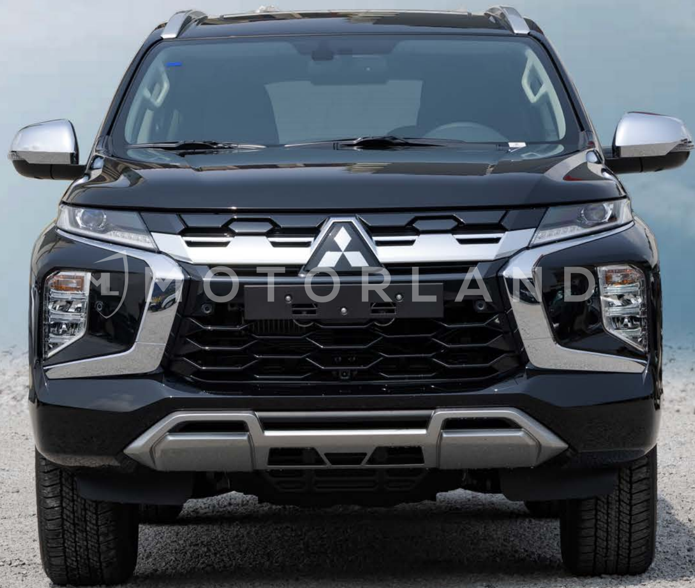
Vue de face