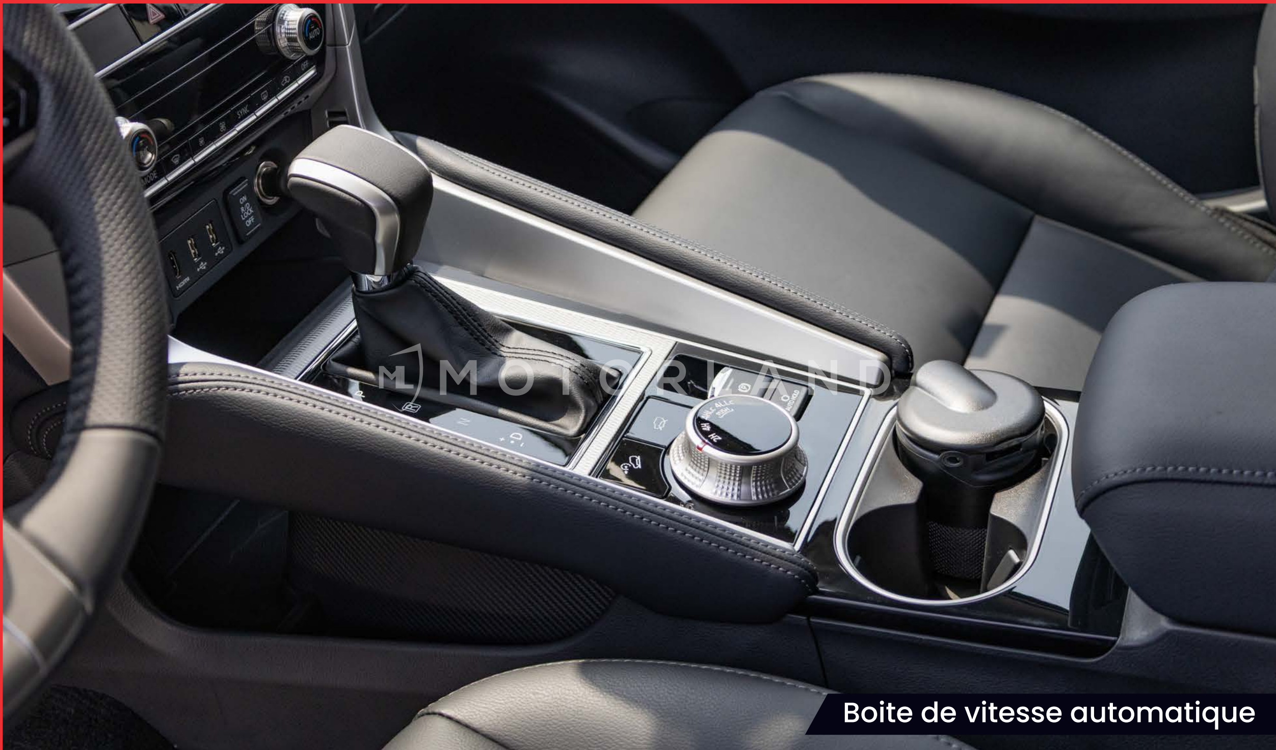
Boite de vitesse automatique