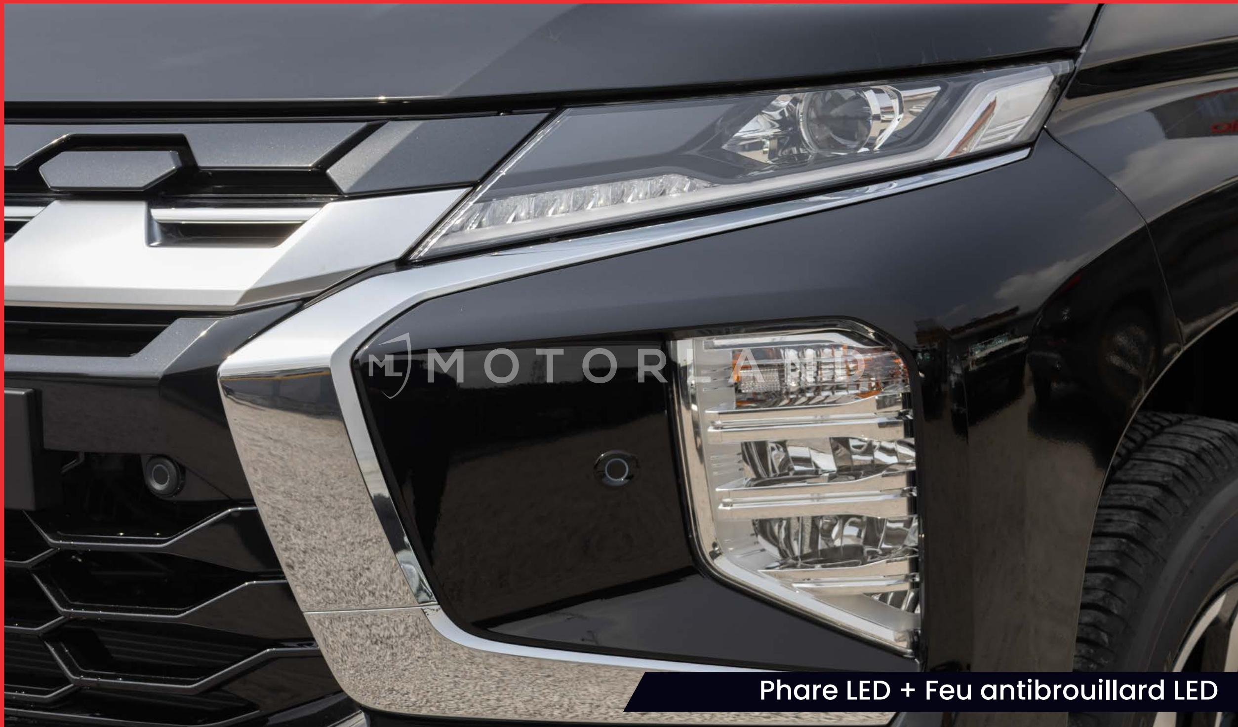
Phare LED + Feu antibrouillard LED