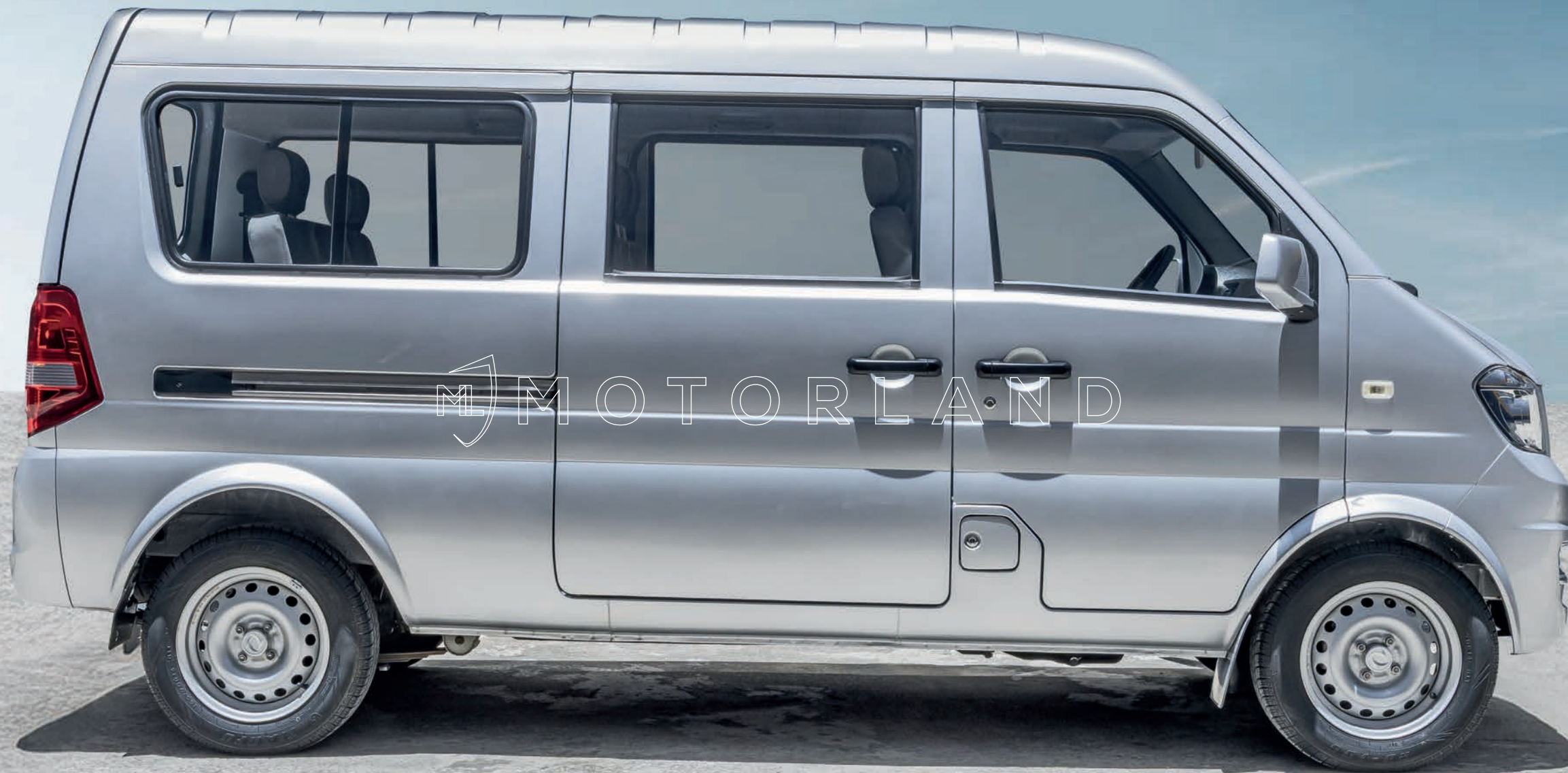
Vue de profil