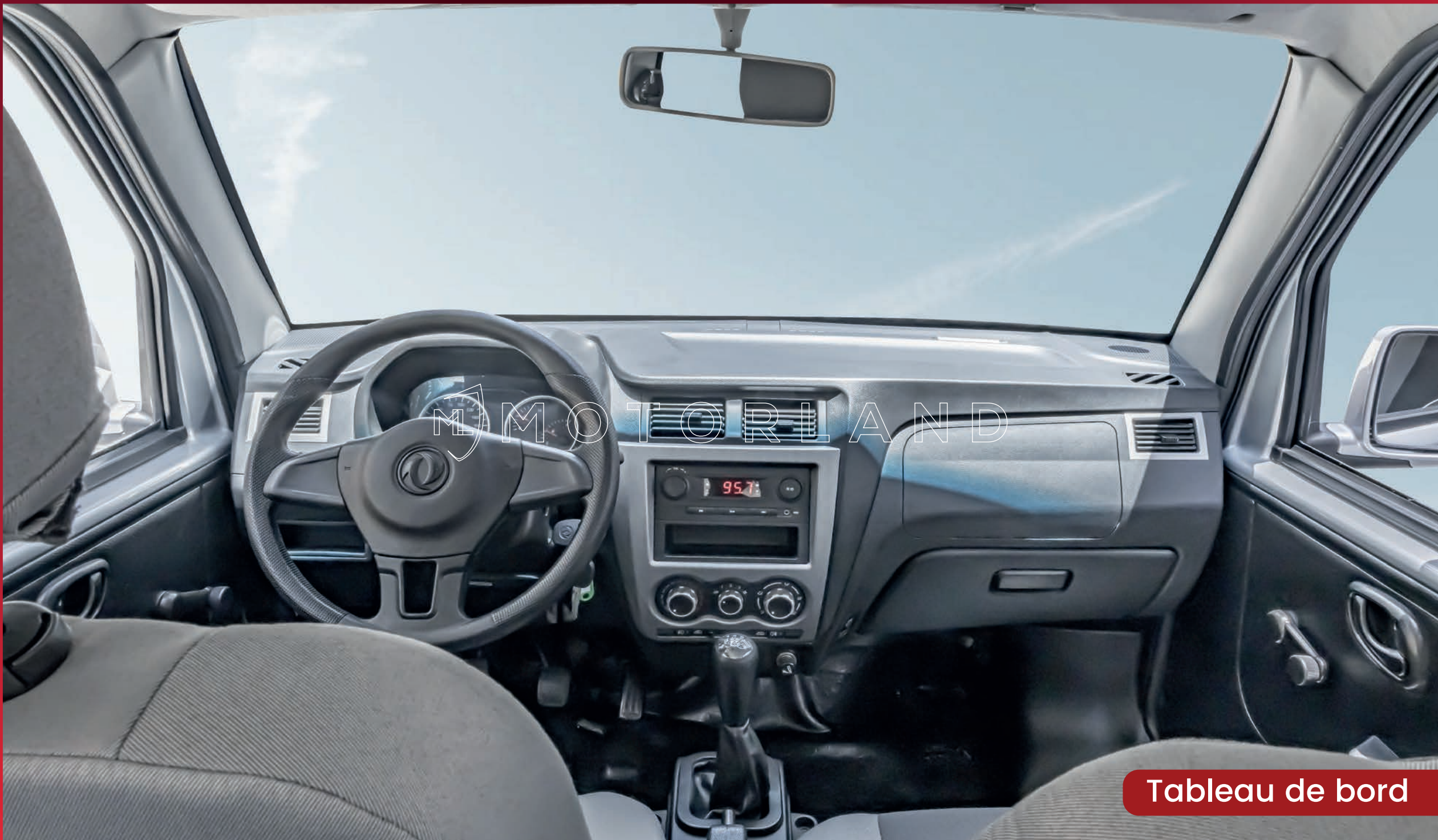
Tableau de bord