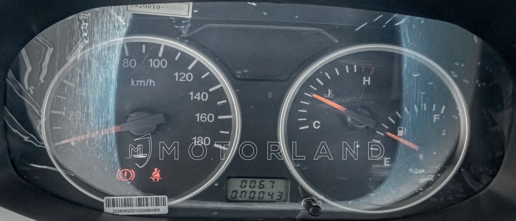
Tableau de bord