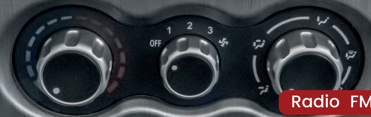
Radio FM + Système ventilation