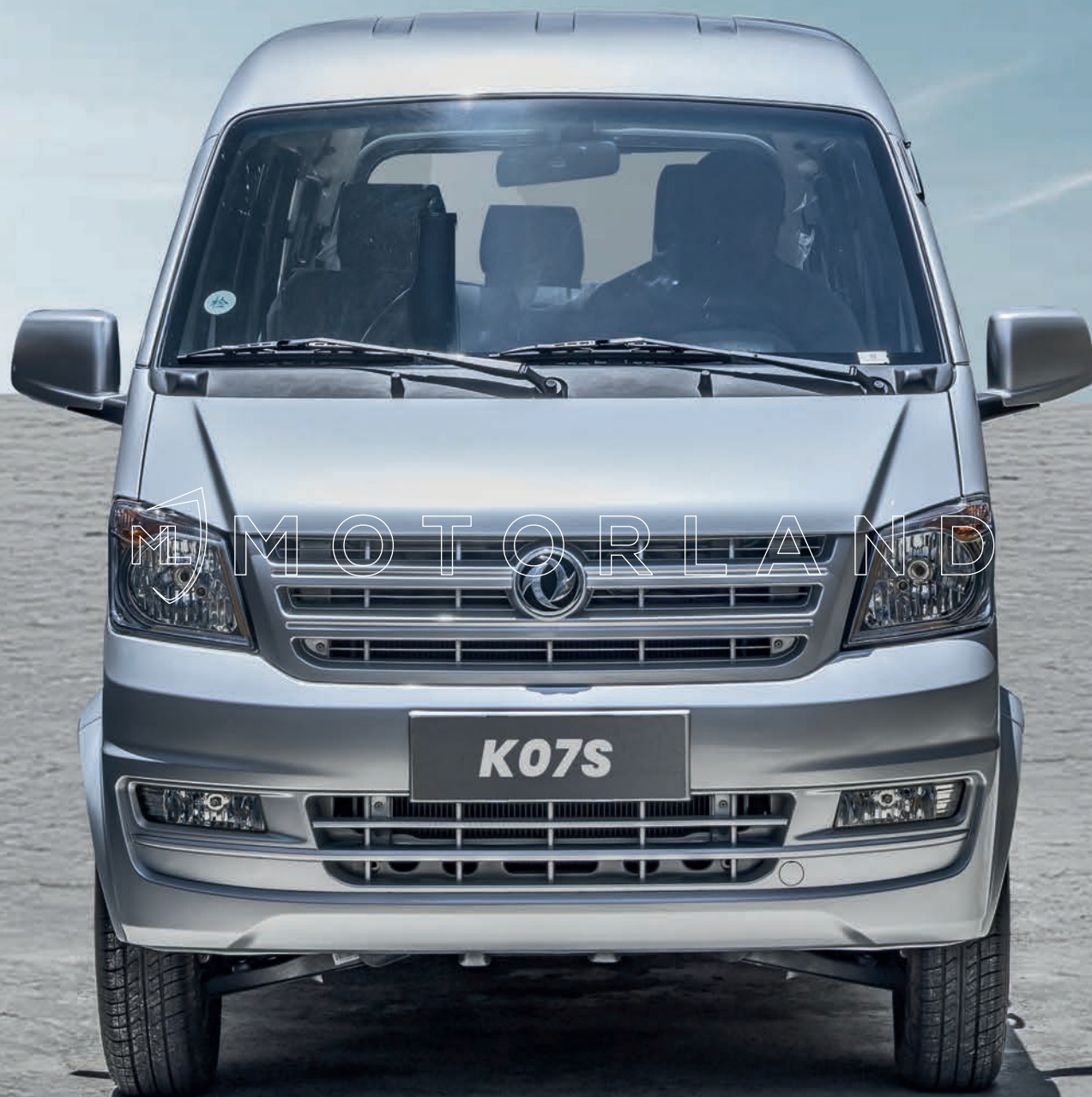
Vue de face