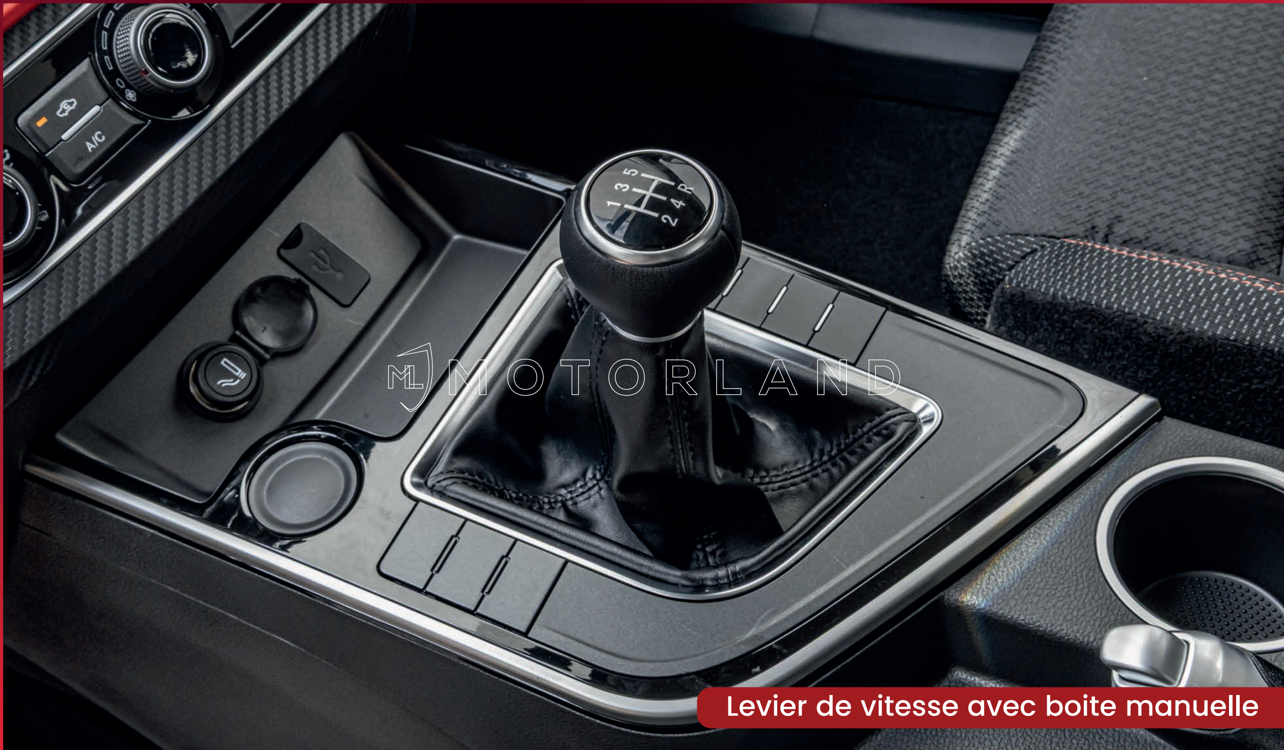
Levier de vitesse avec boite manuelle