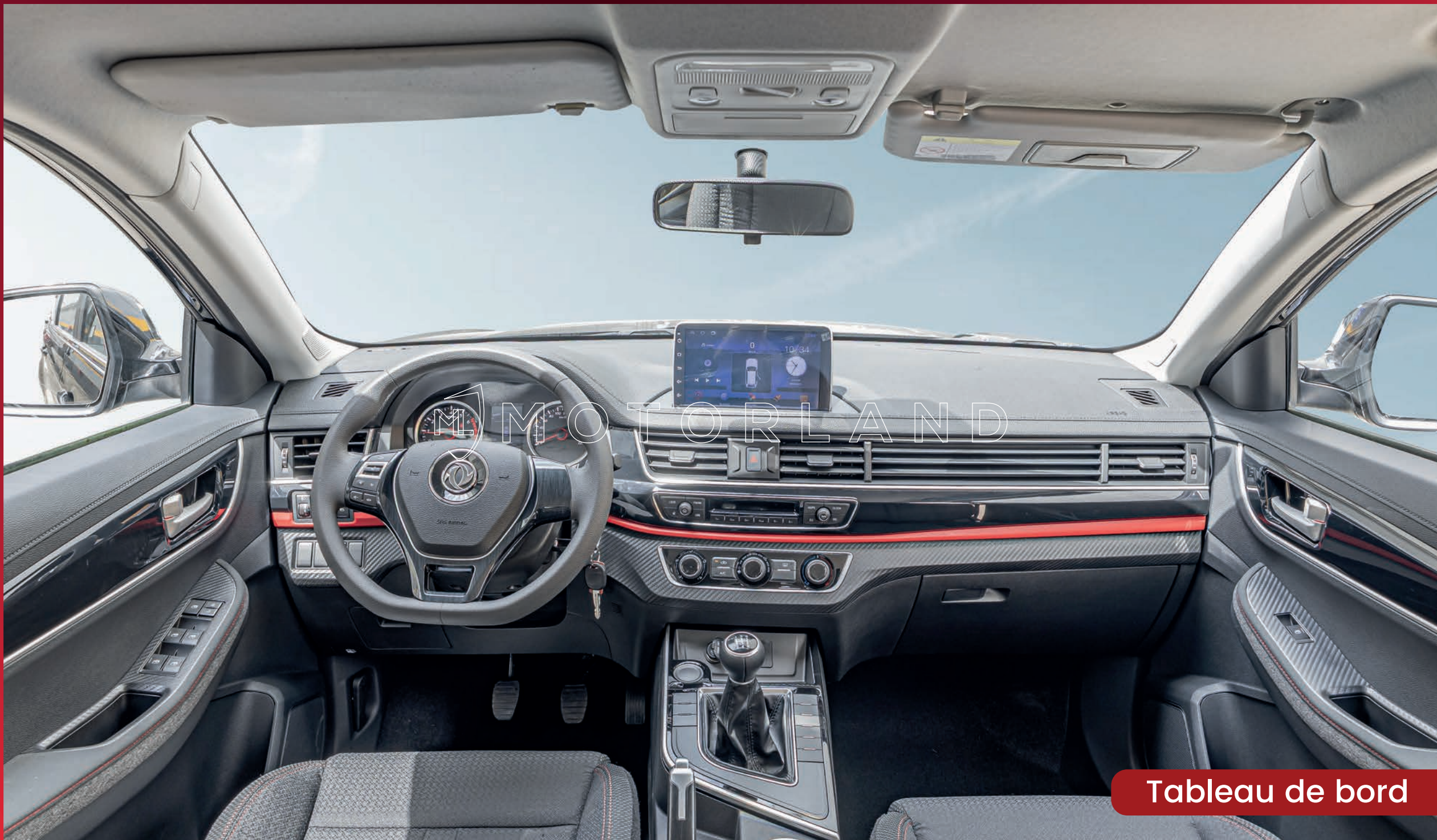
Tableau de bord