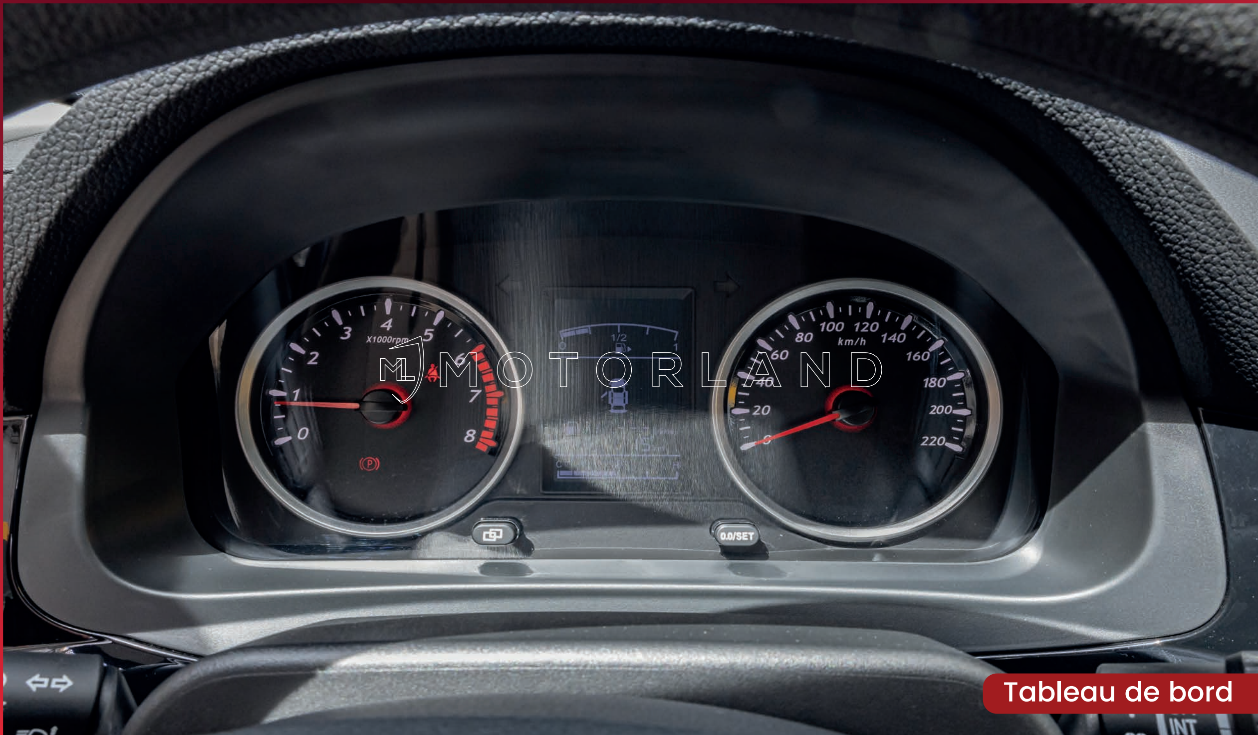
Tableau de bord