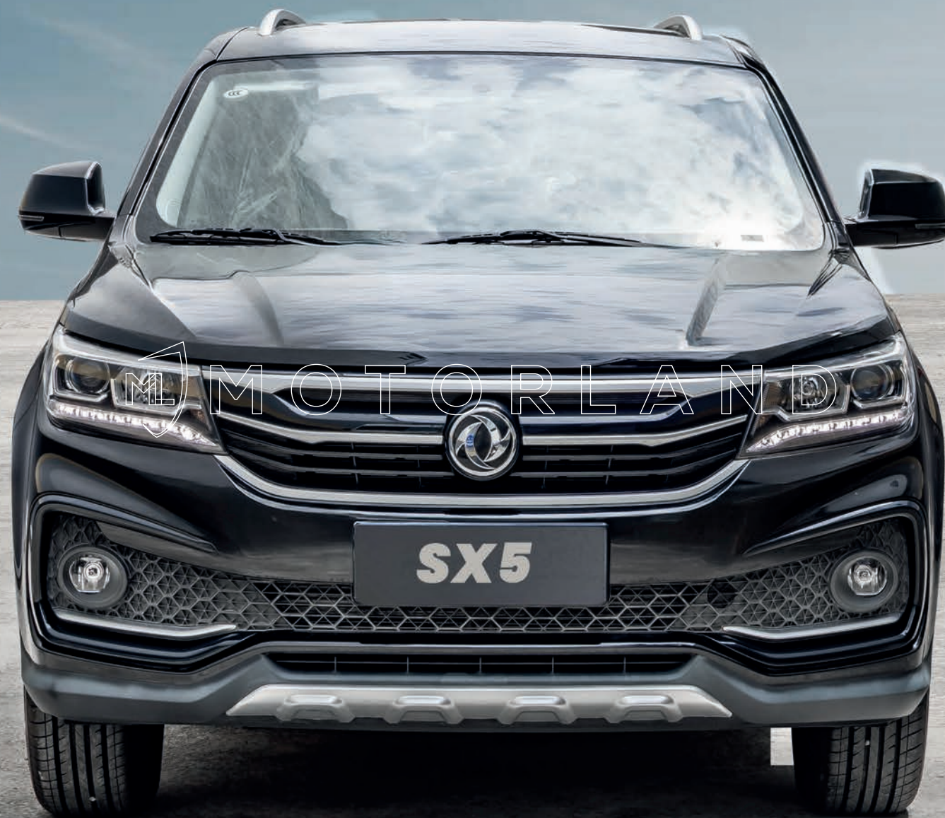
Vue de face