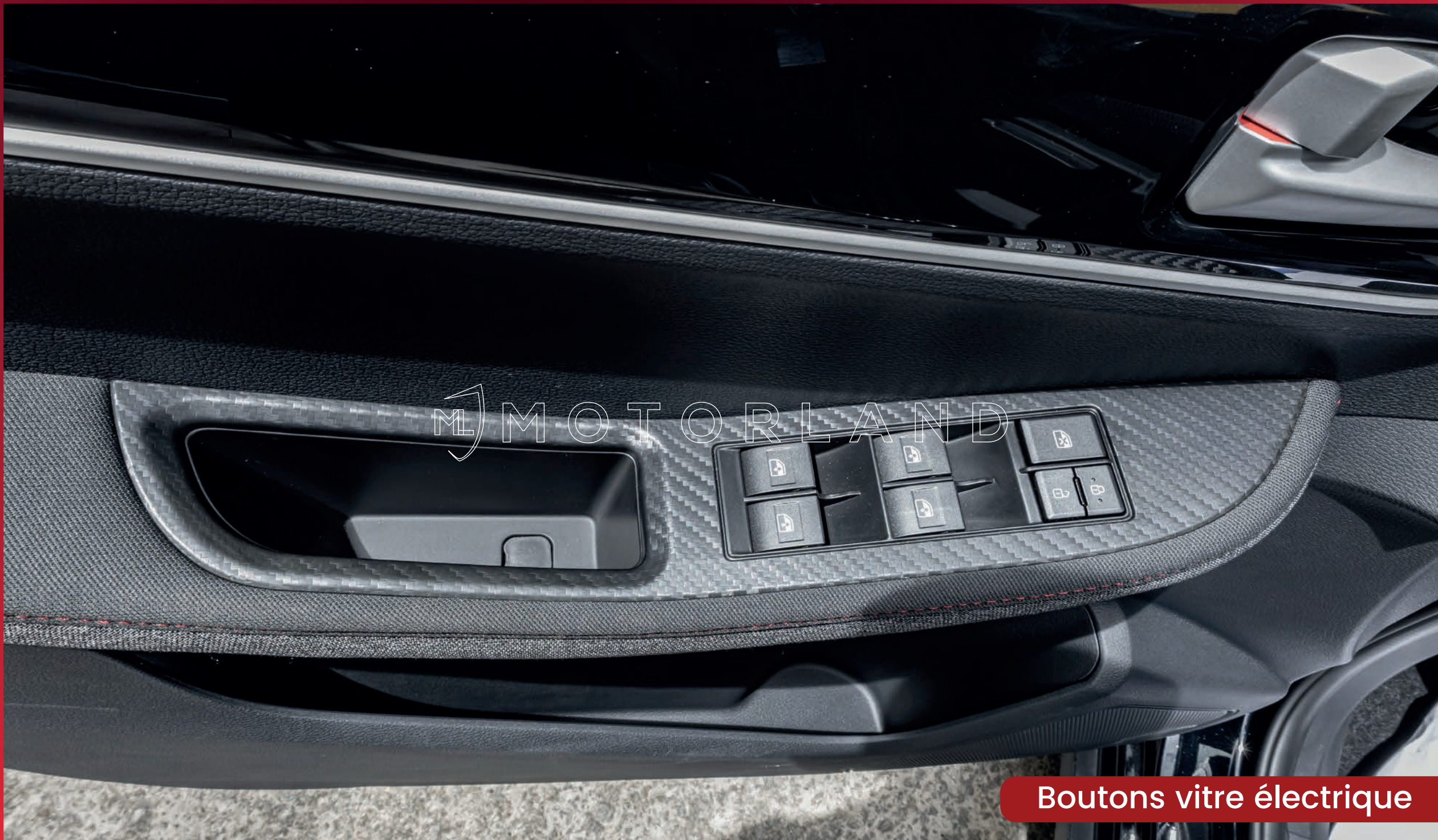
Boutons vitre électrique