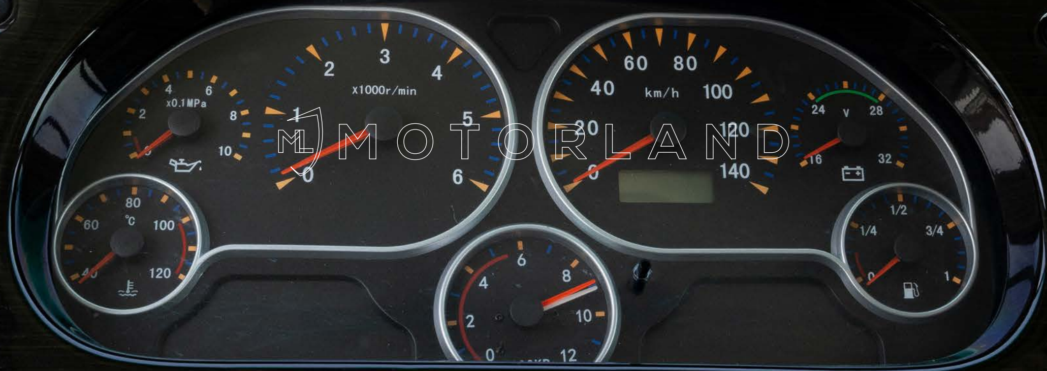
Tableau de bord