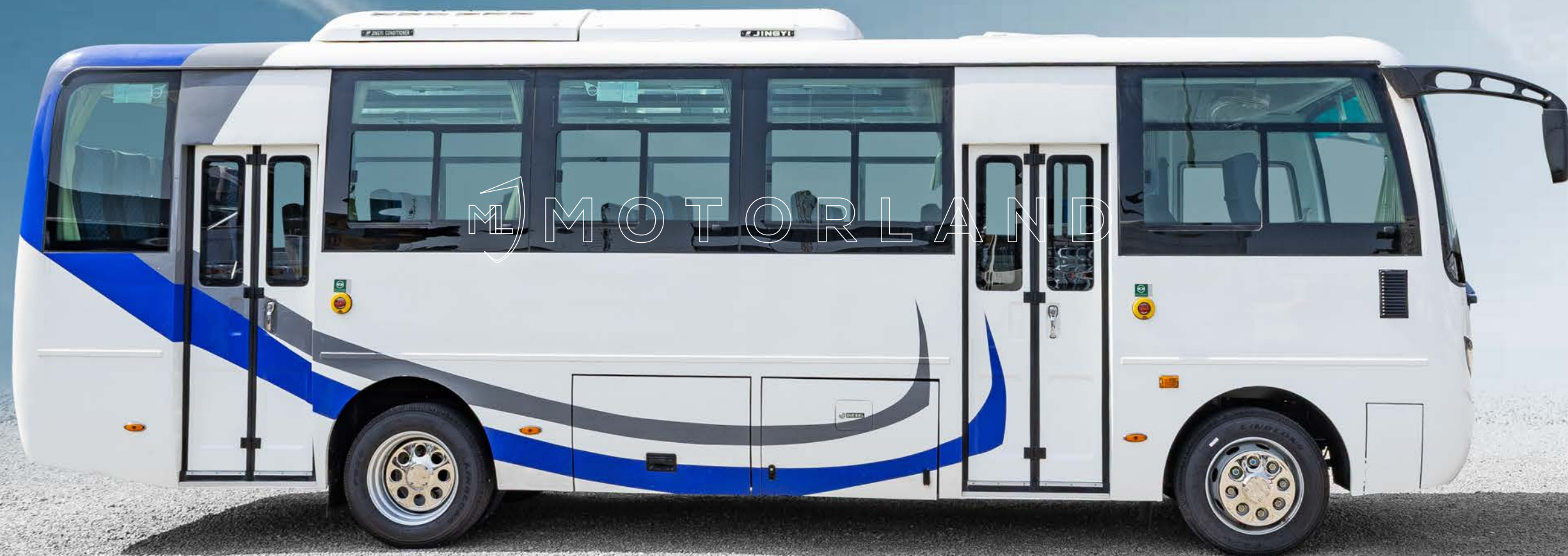
Vue de profil