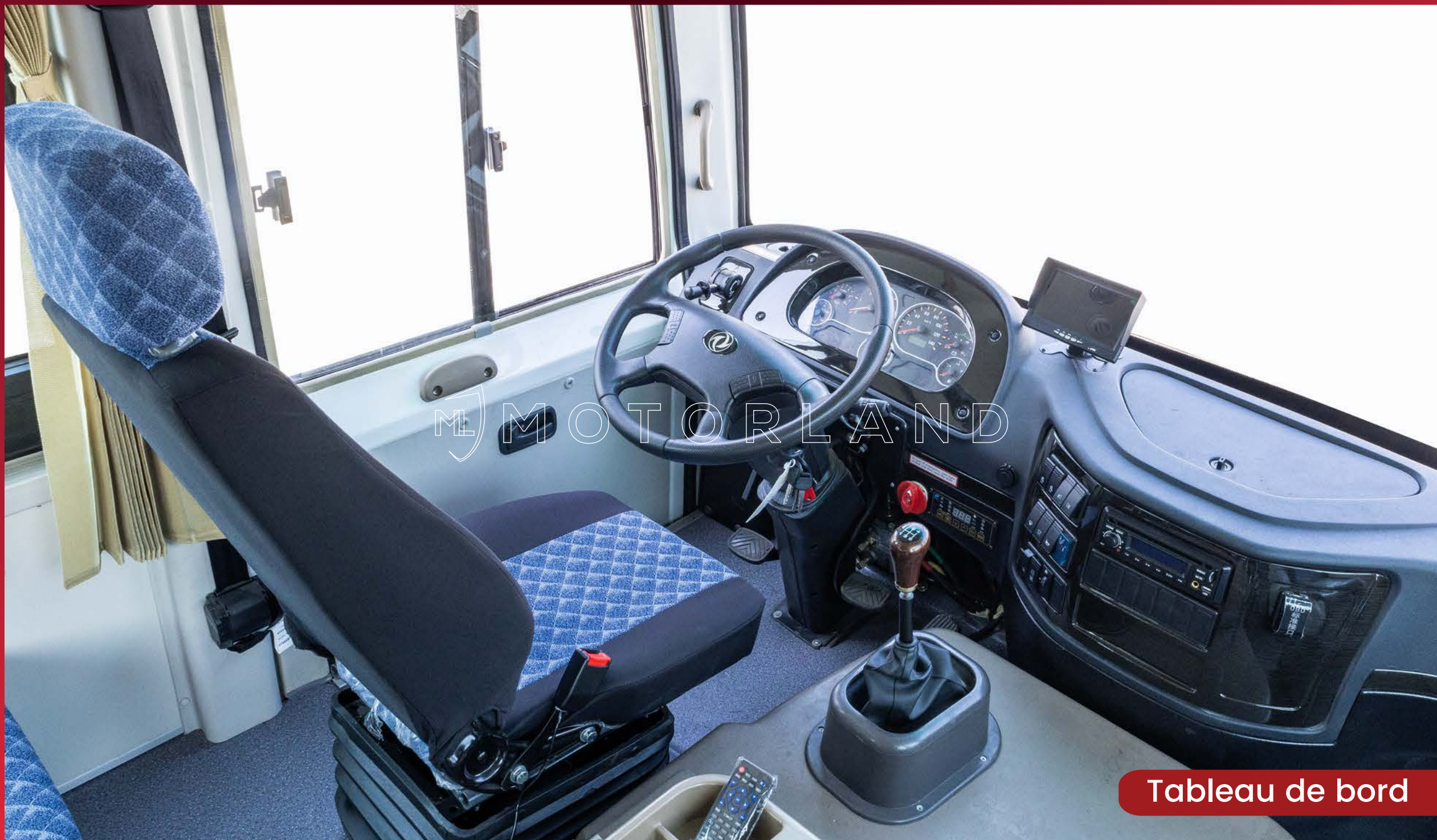
Tableau de bord