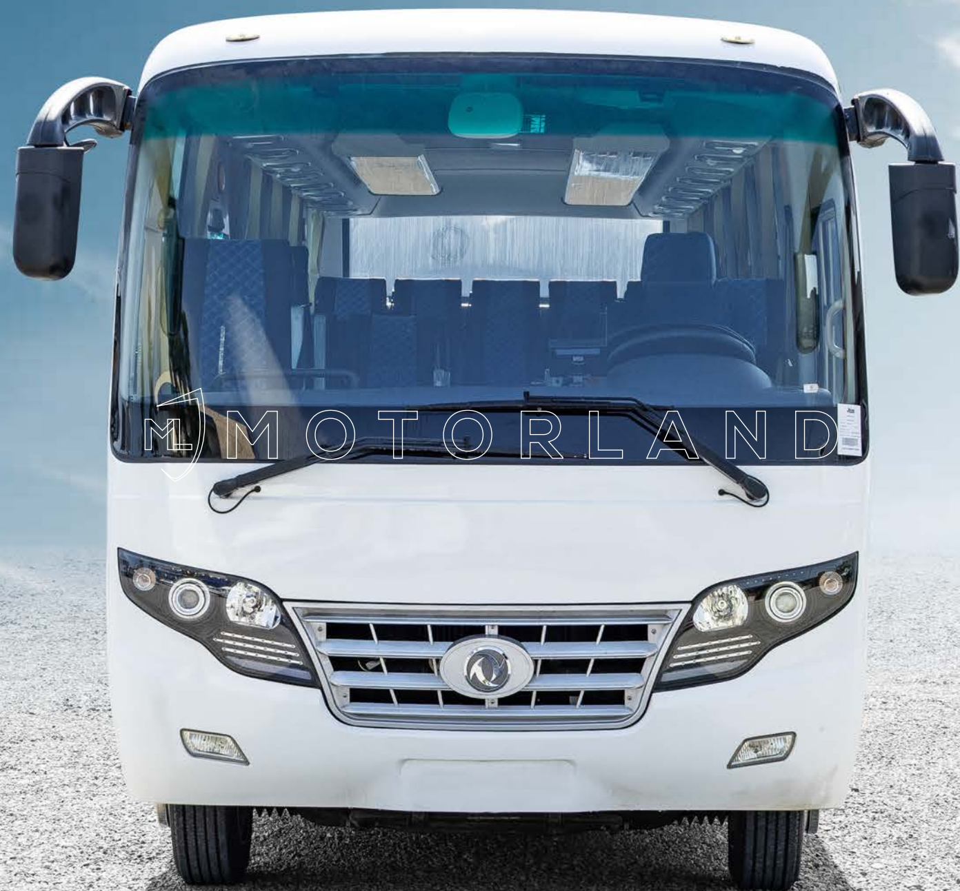
Vue de face