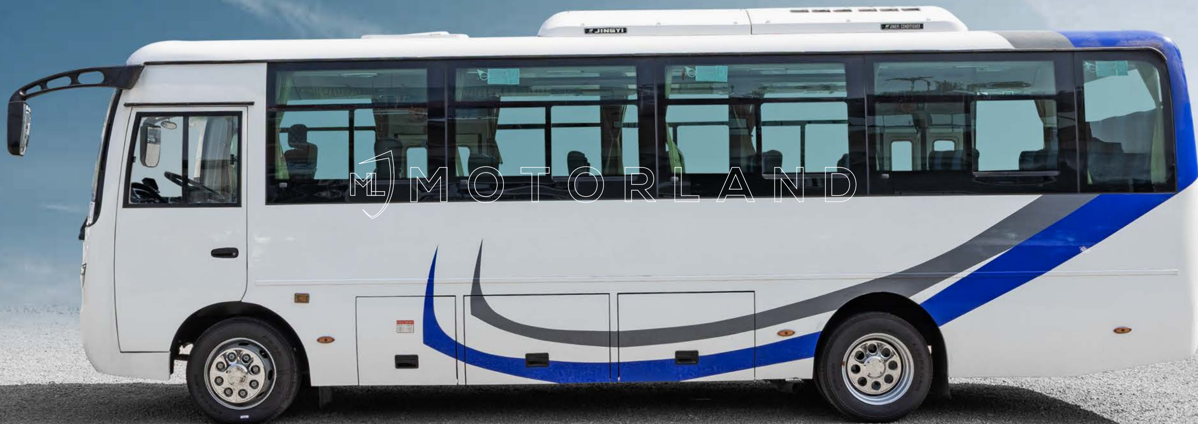
Vue de profil