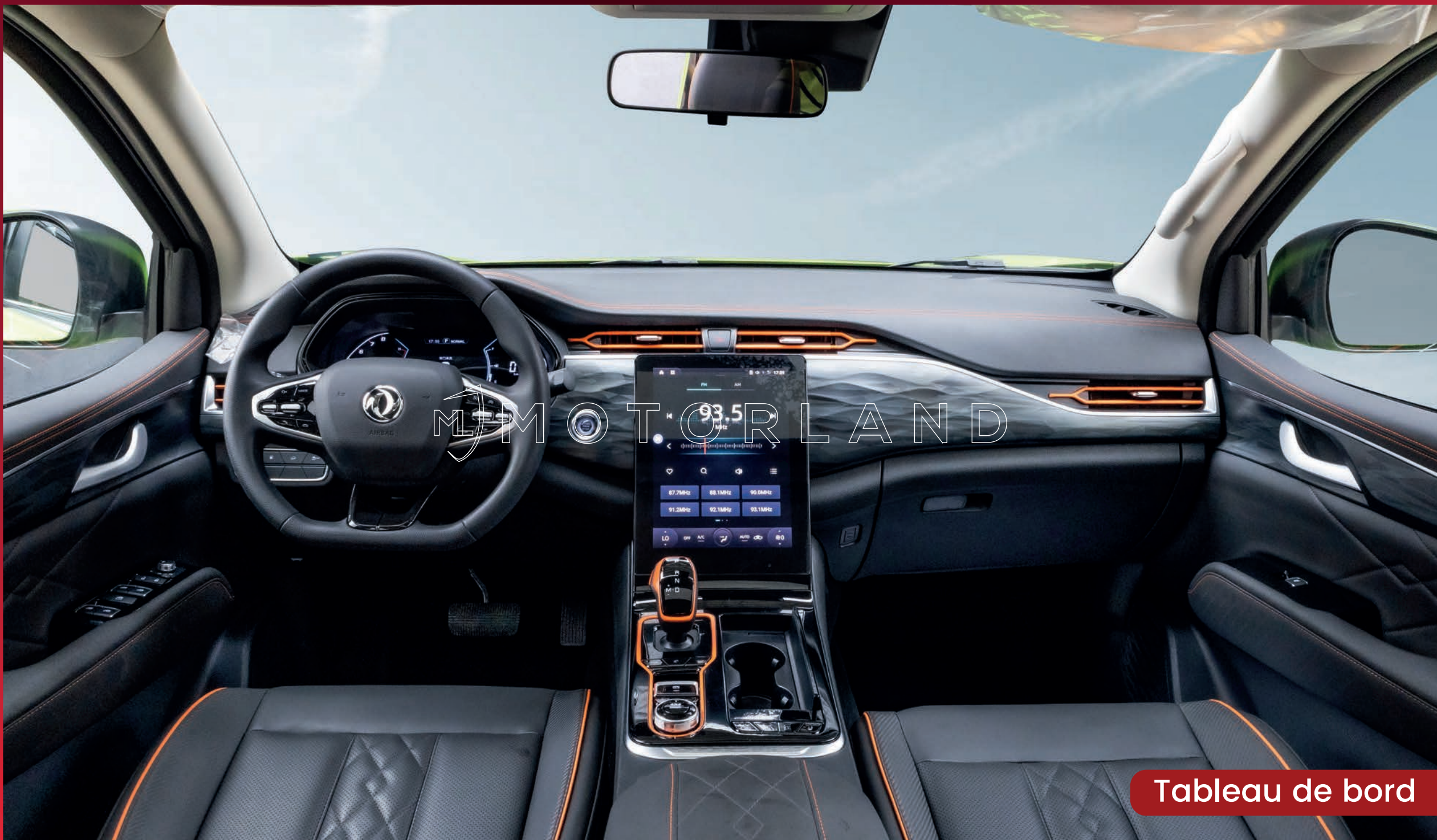
Tableau de bord