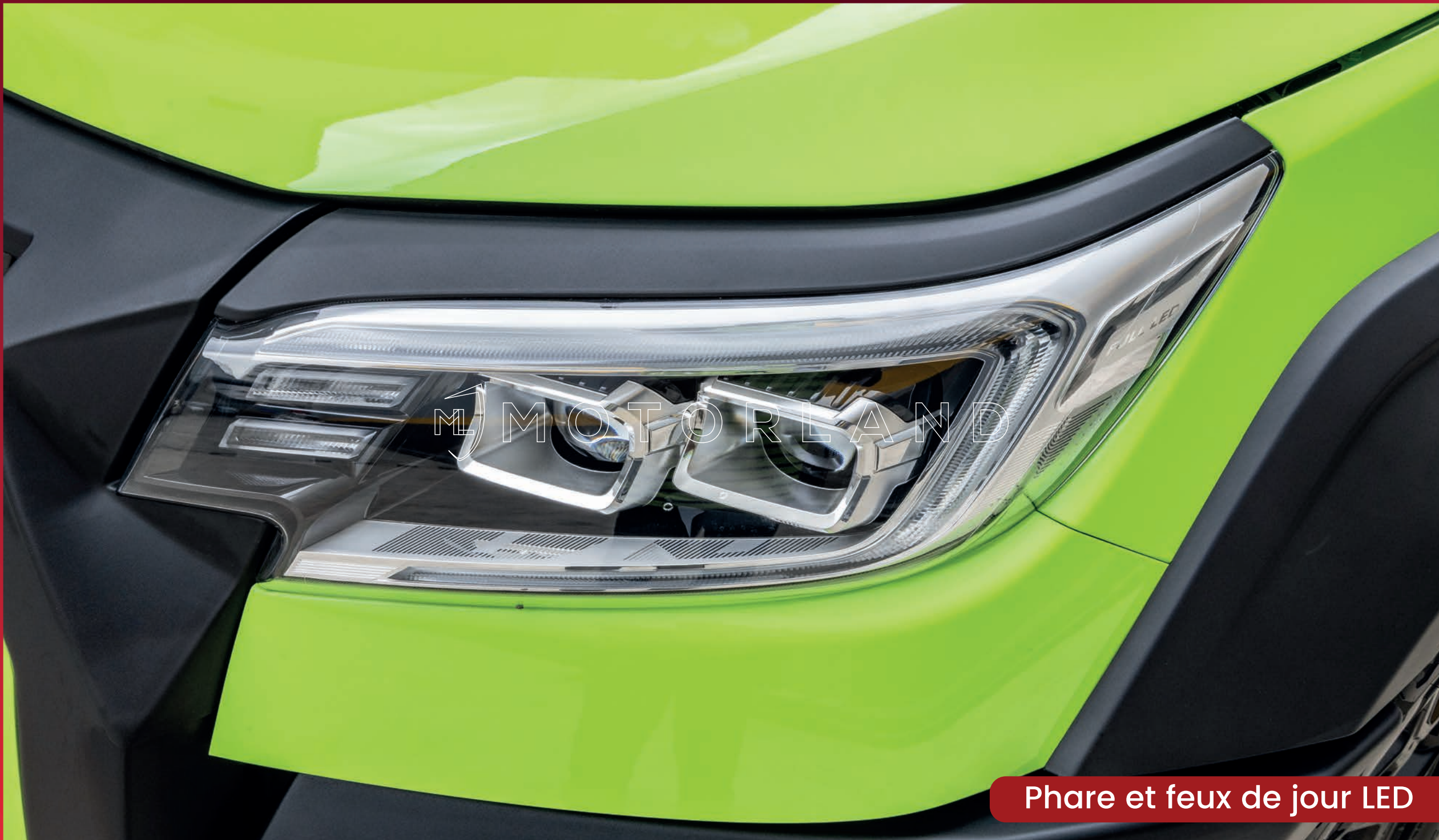
Phare et feux de jour LED