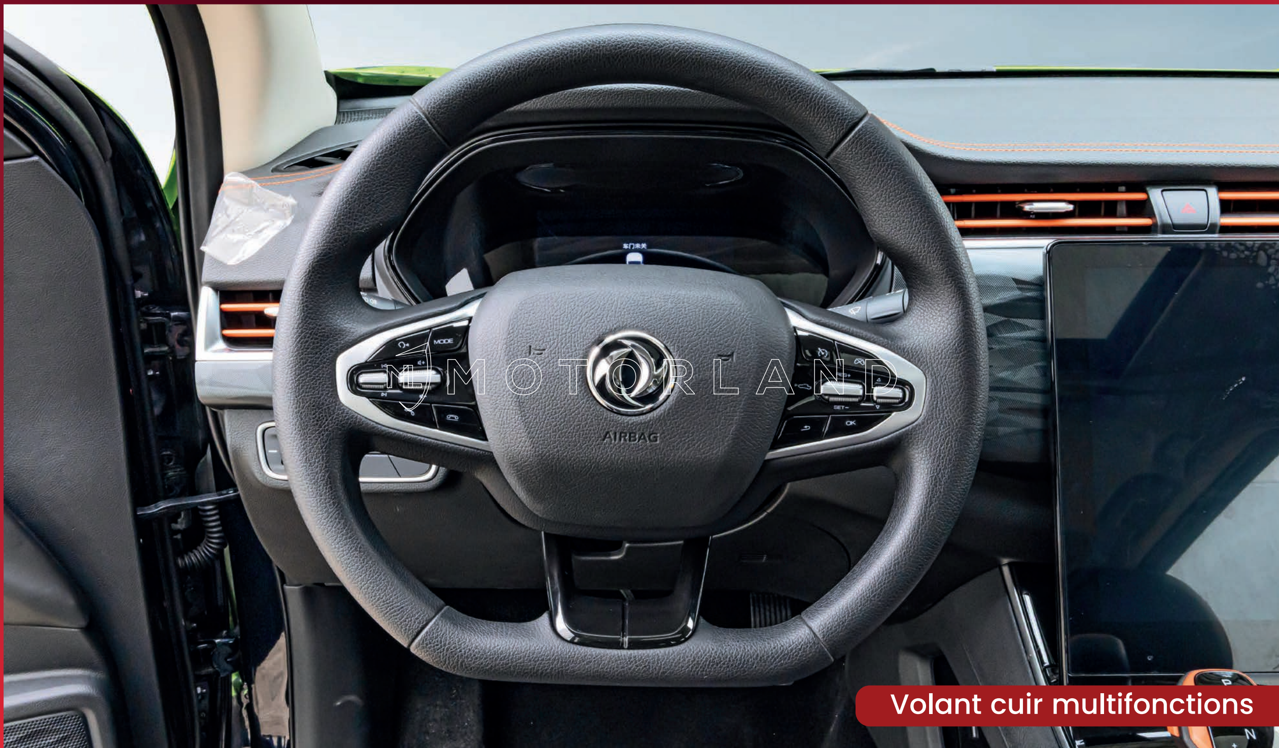
Volant cuir multifonctions