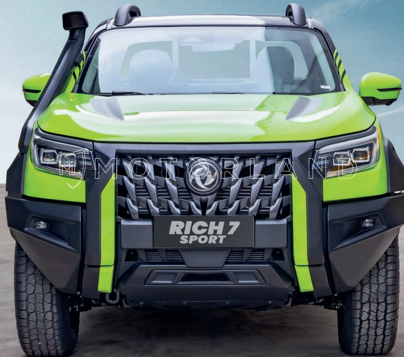
Vue de face