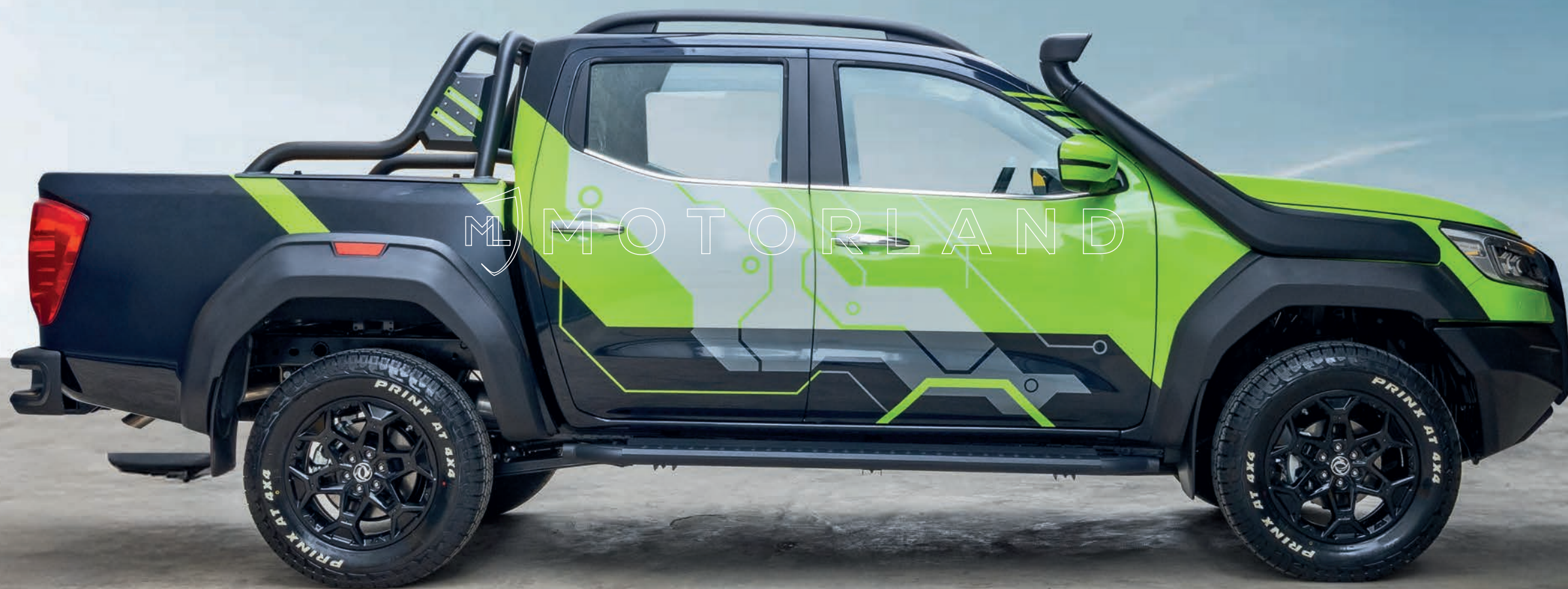
Vue de profil