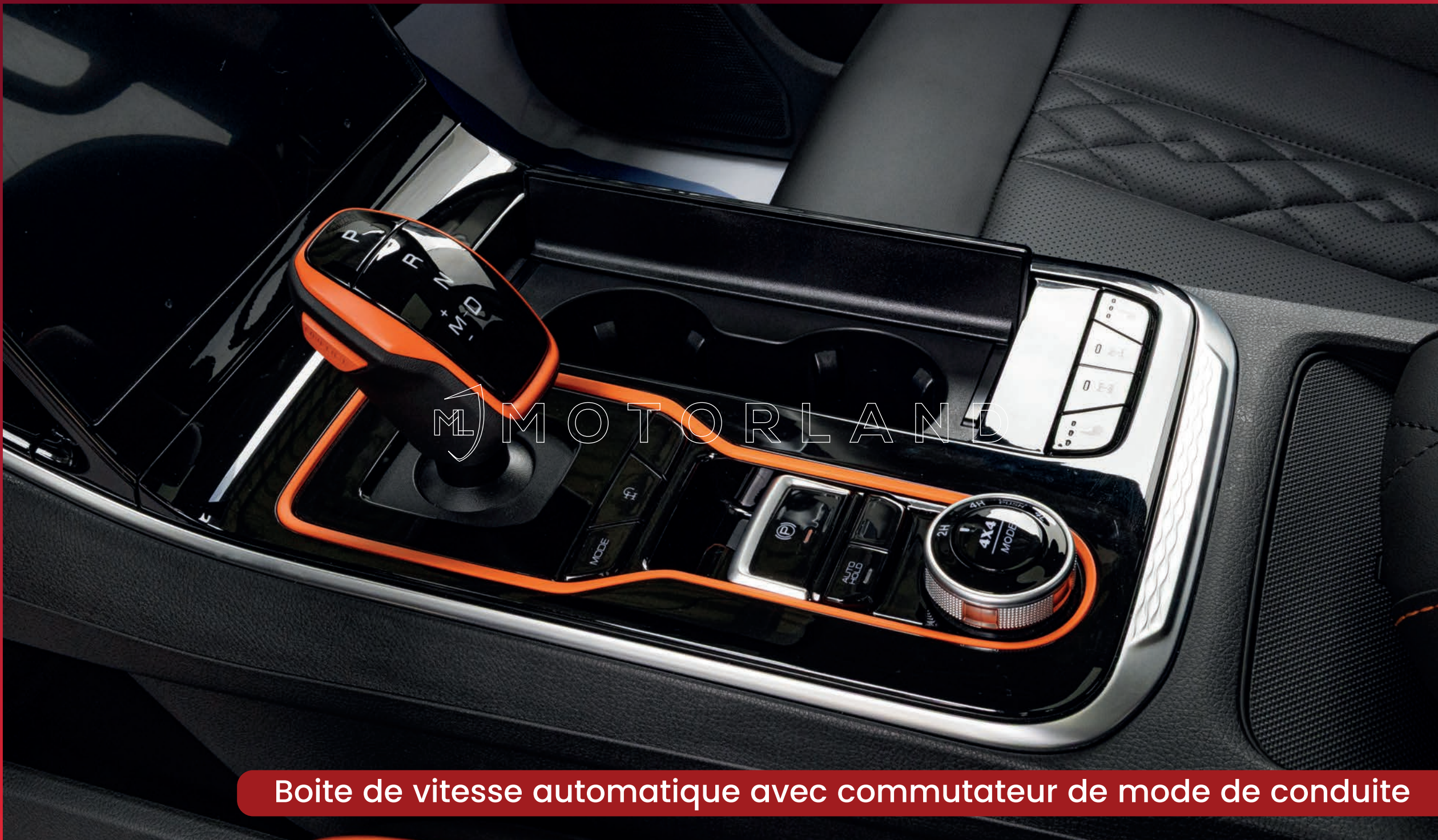
Boite de vitesse automatique avec commutateur de mode de conduite