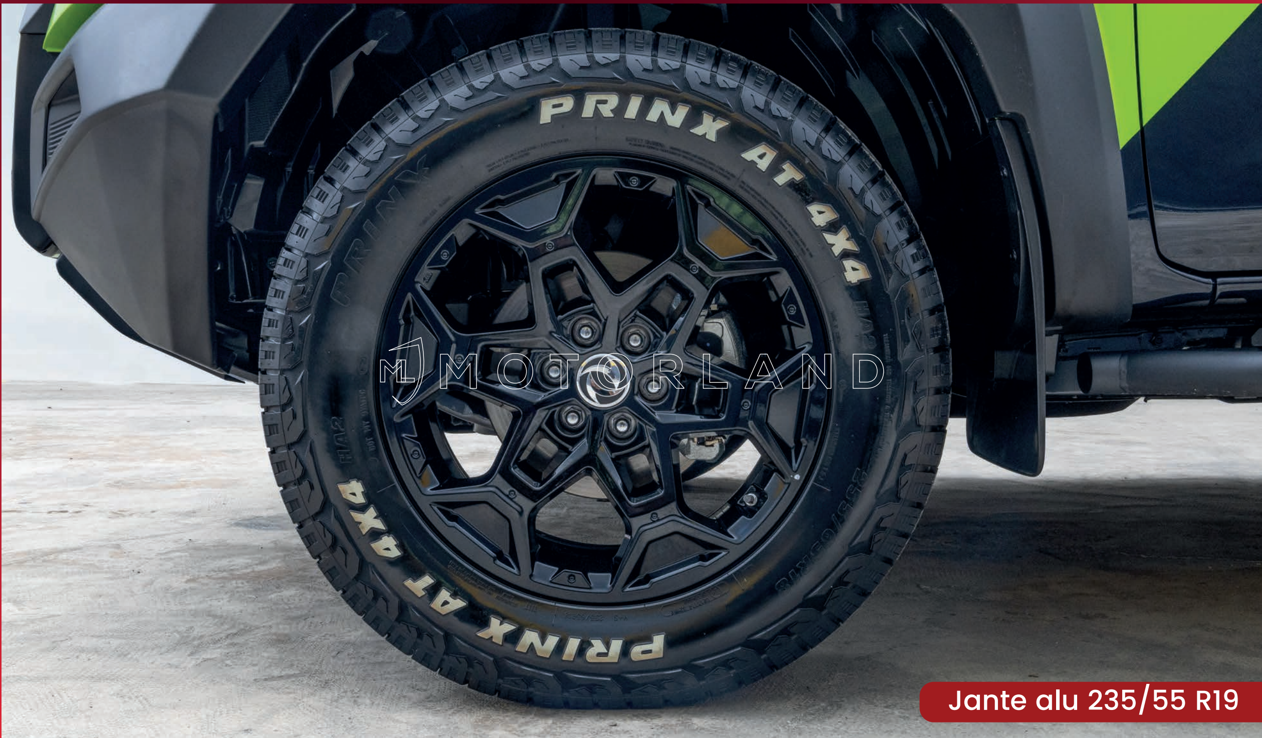
Jante alu 235/55 R19