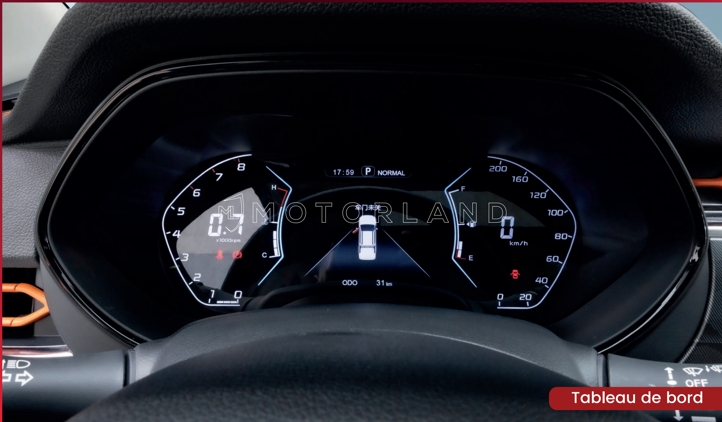
Tableau de bord