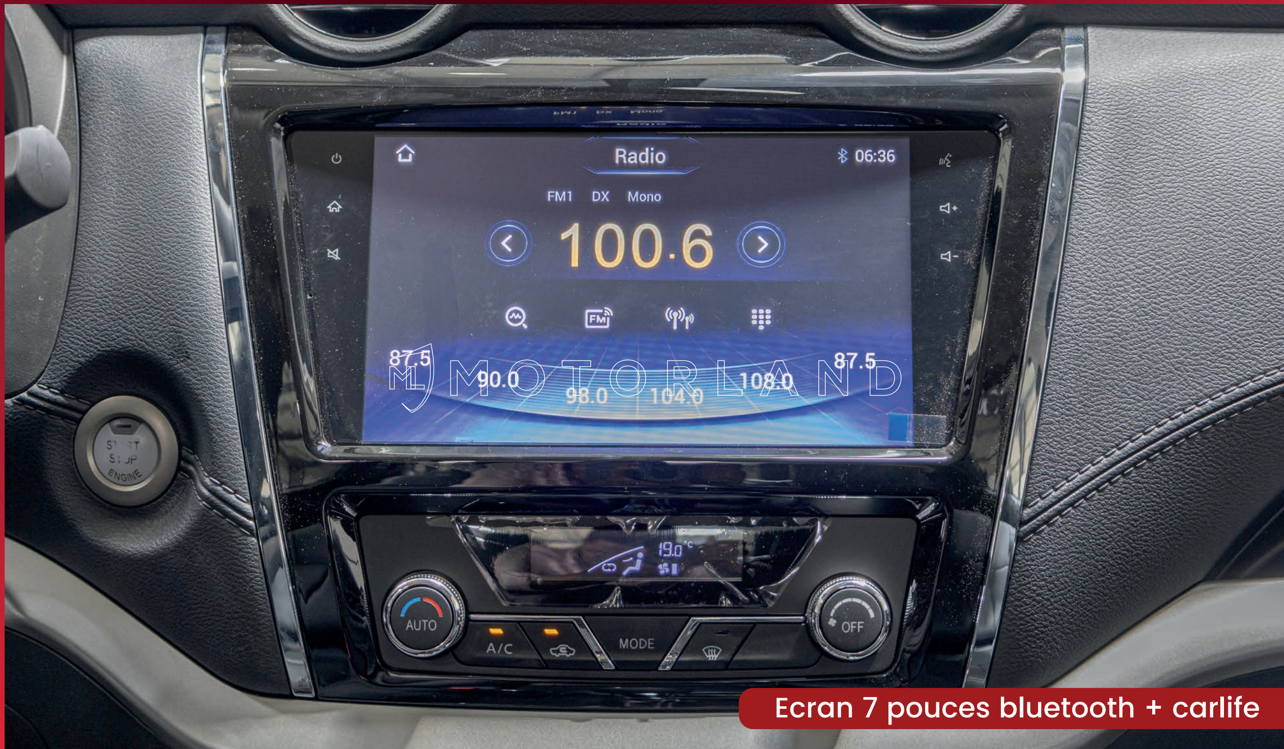
Ecran 7 pouces bluetooth + carlife