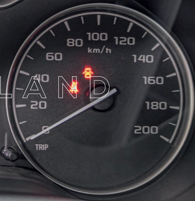
Tableau de bord