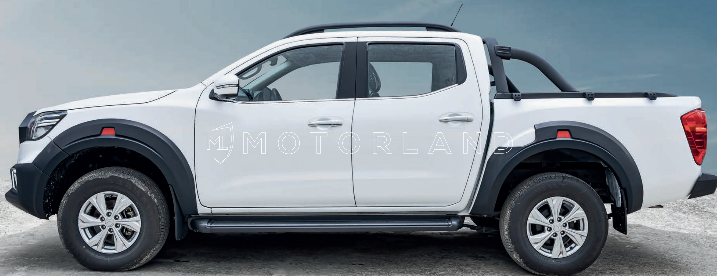
Vue de profil