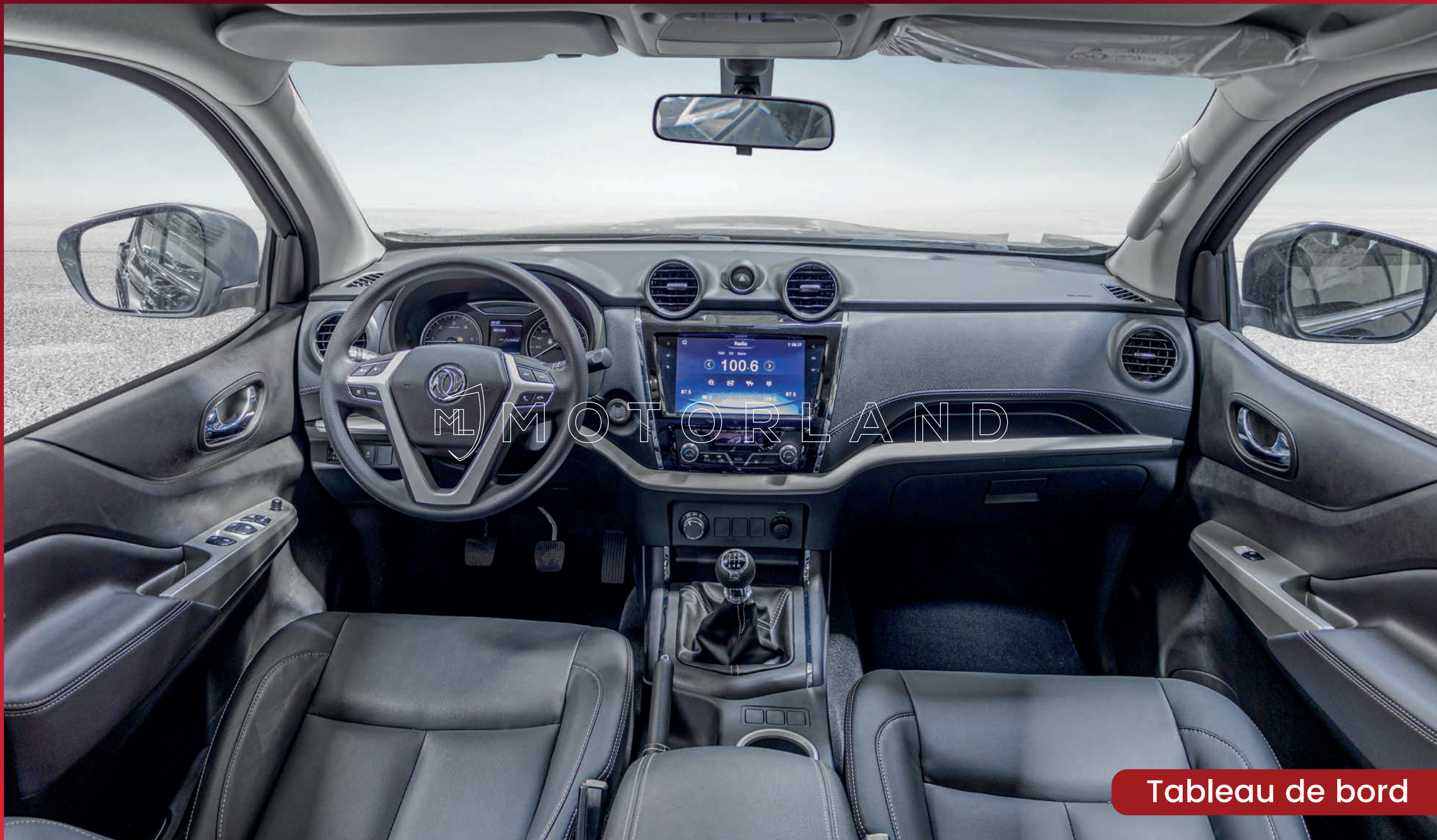
Tableau de bord