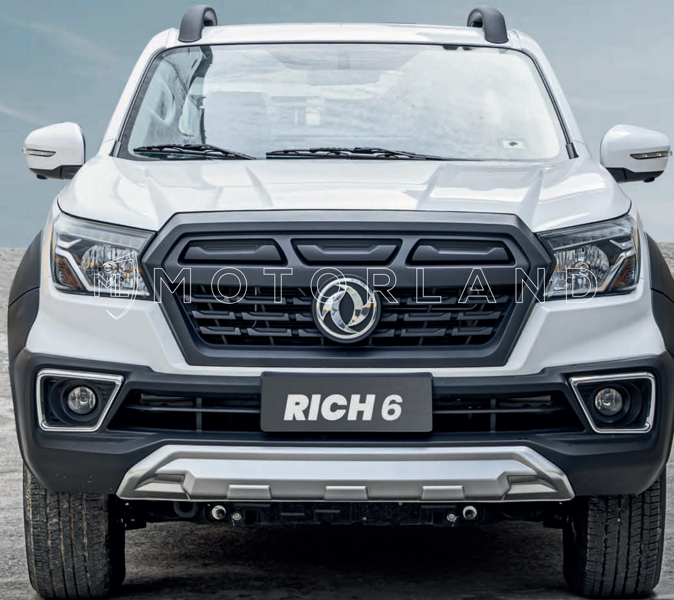
Vue de face