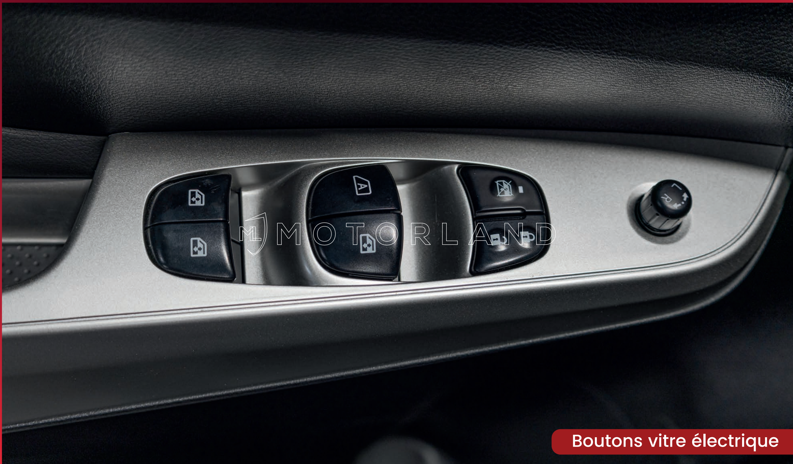
Boutons vitre électrique