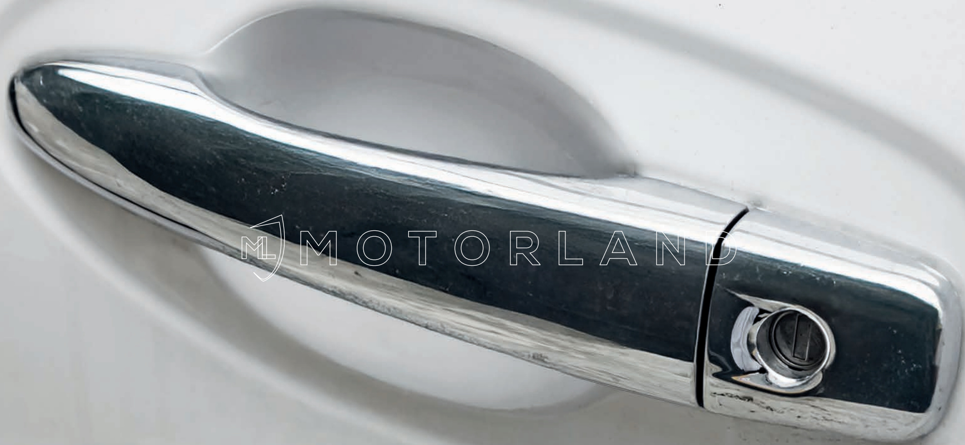
Poignée à verrouillage centralisé