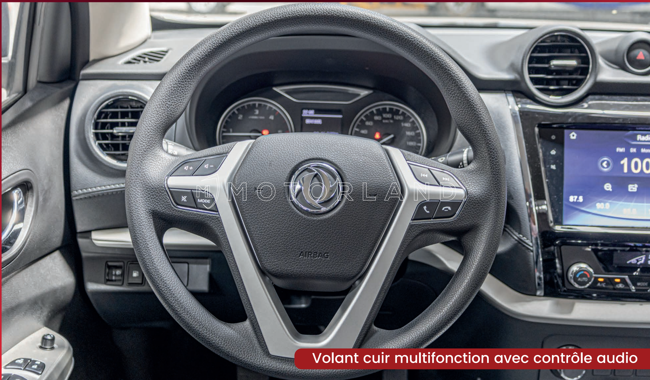
Volant cuir multifonction avec contrôle audio