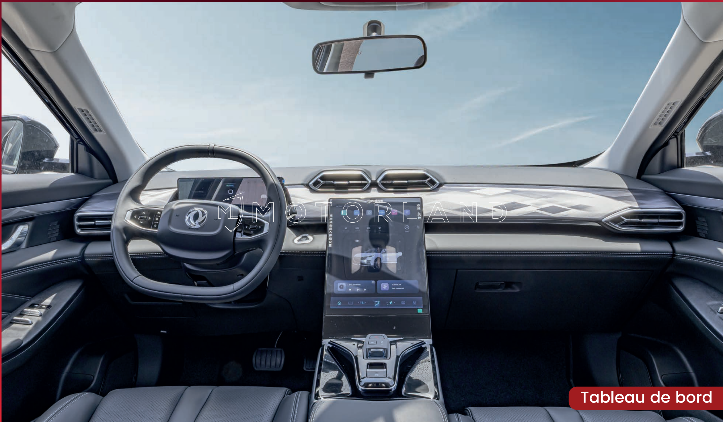
Tableau de bord