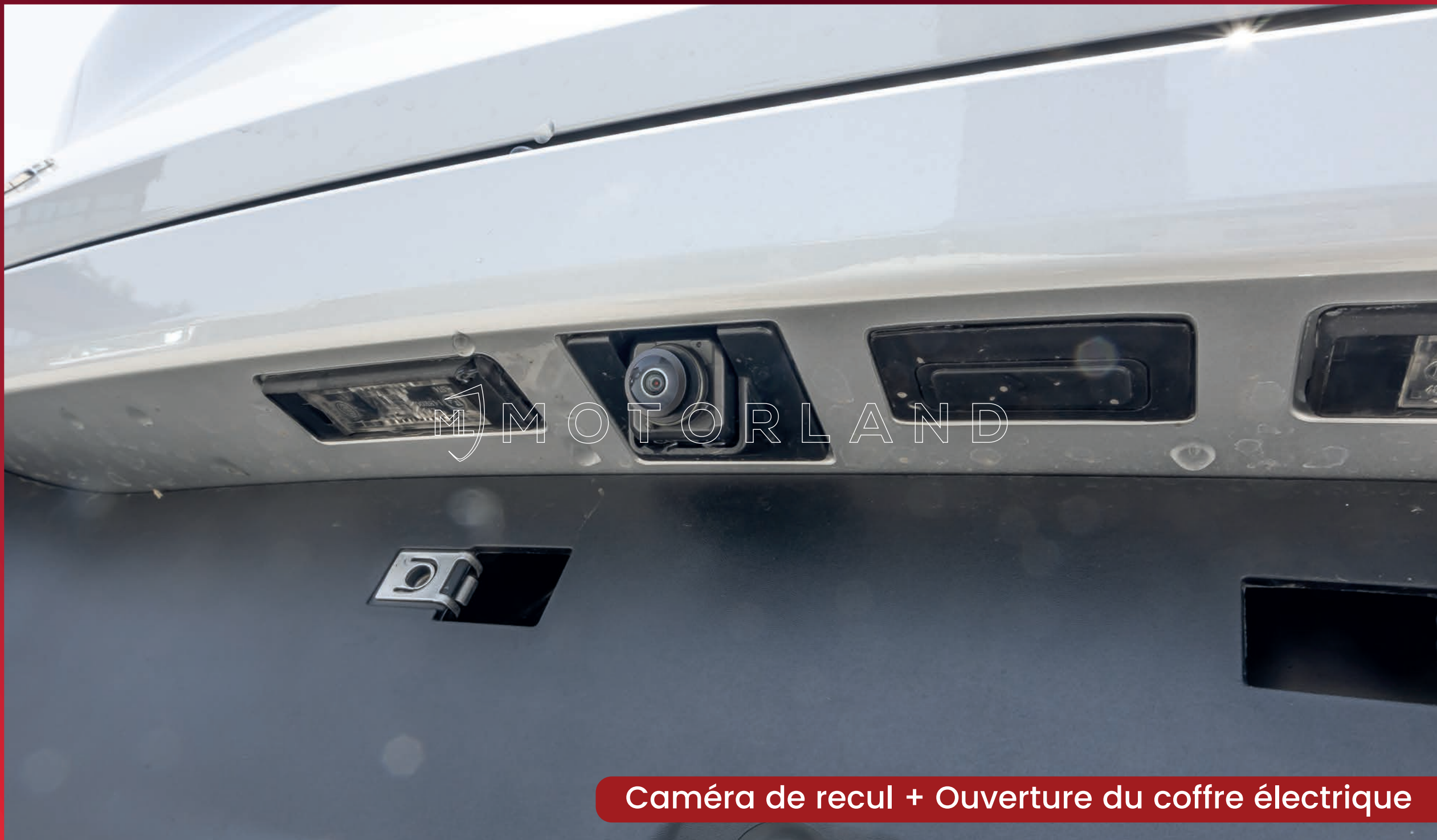
Caméra de recul + Ouverture du coffre électrique