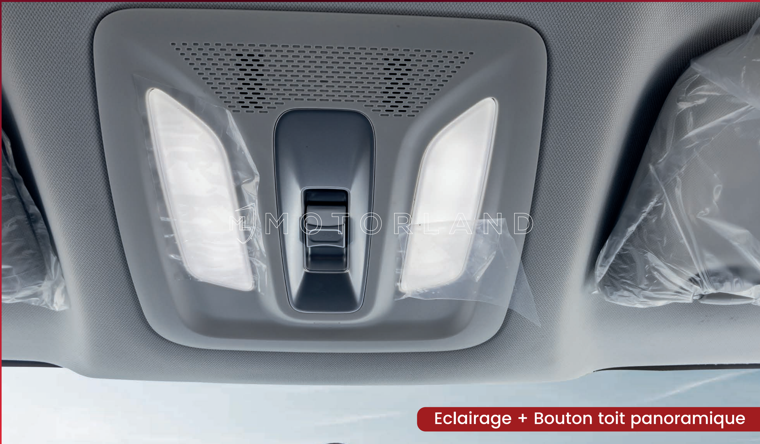
Eclairage + Bouton toit panoramique