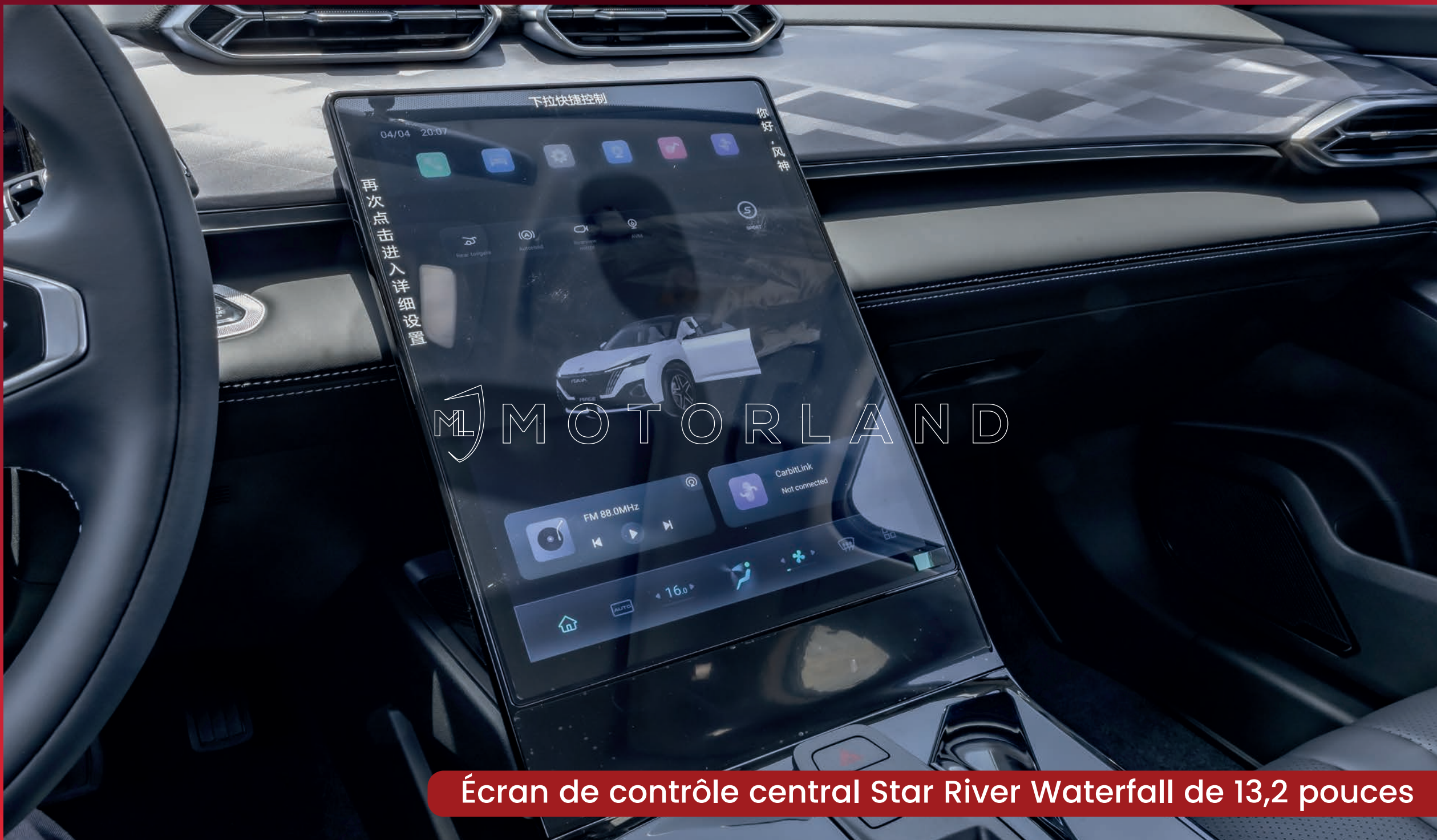
Écran de contrôle central Star River Waterfall de 13,2 pouces