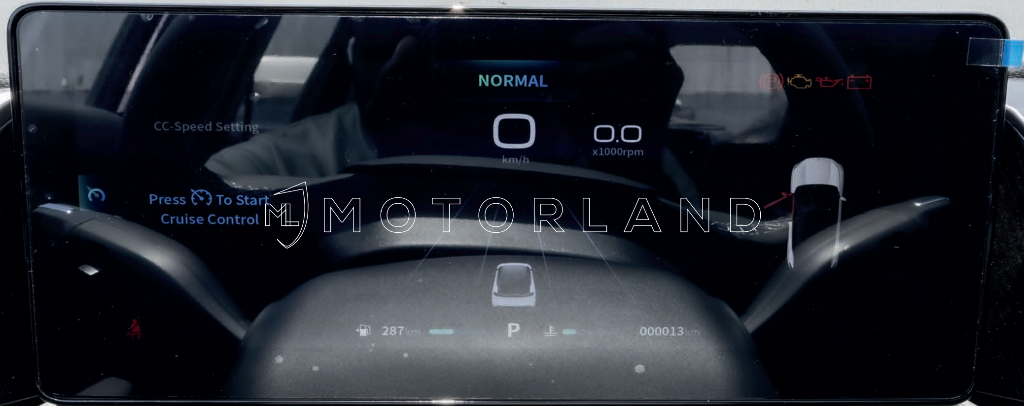
Tableau de bord Instrument LCD complet entourant Star River de 10,25 pouces