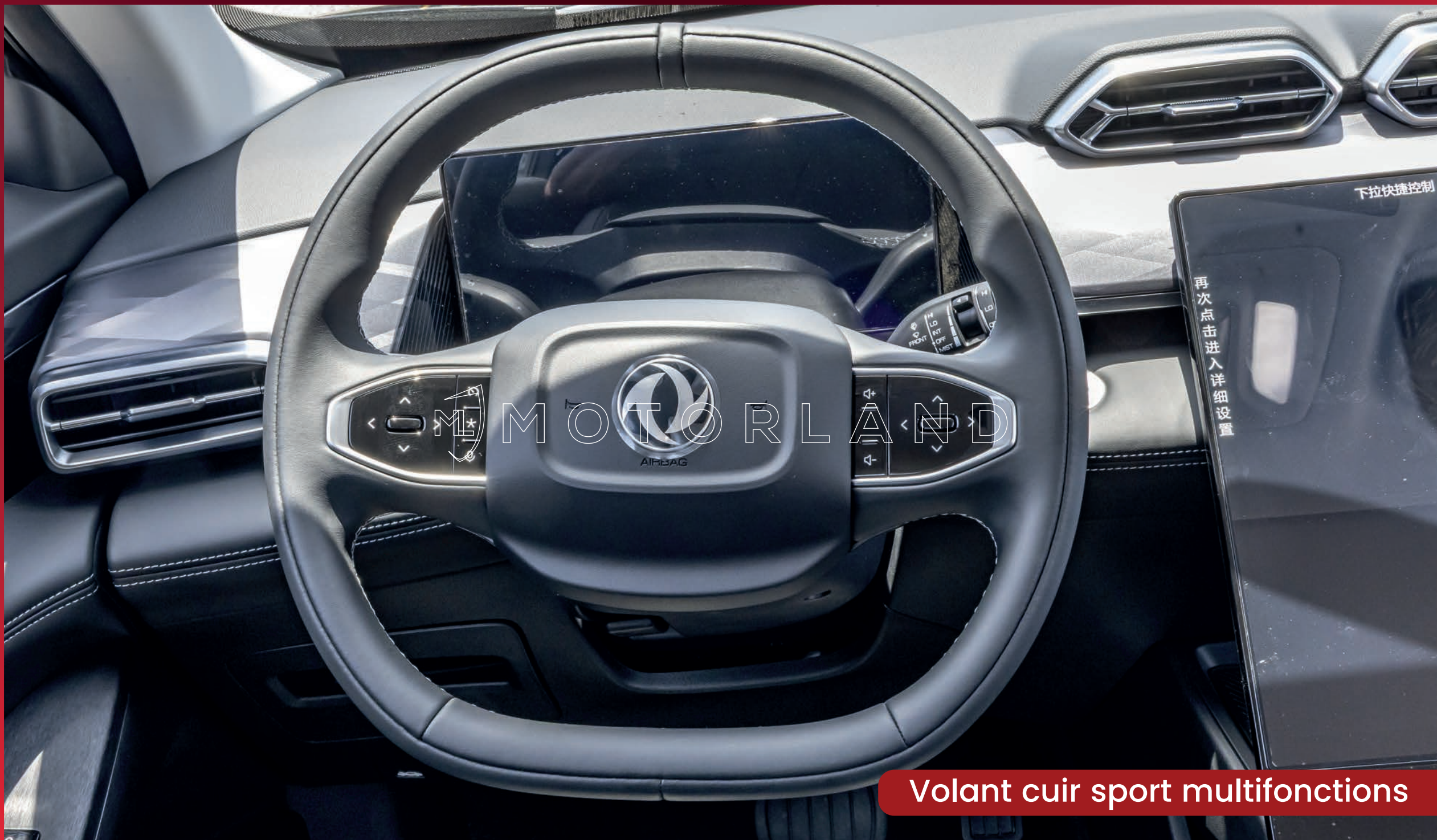
Volant cuir sport multifonctions