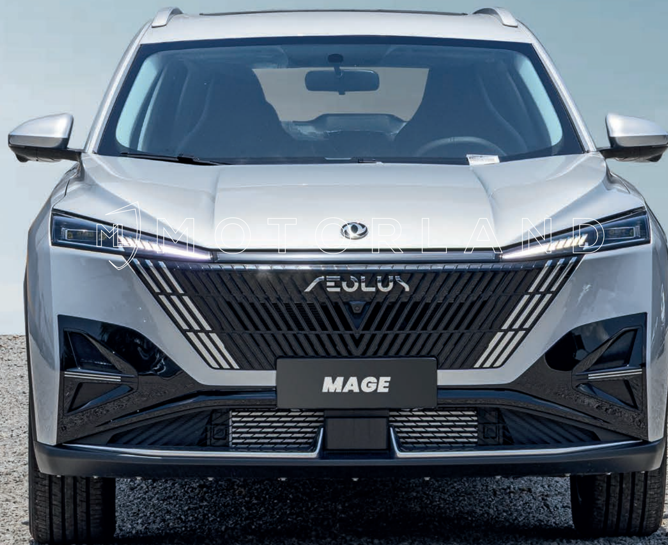
Vue de face