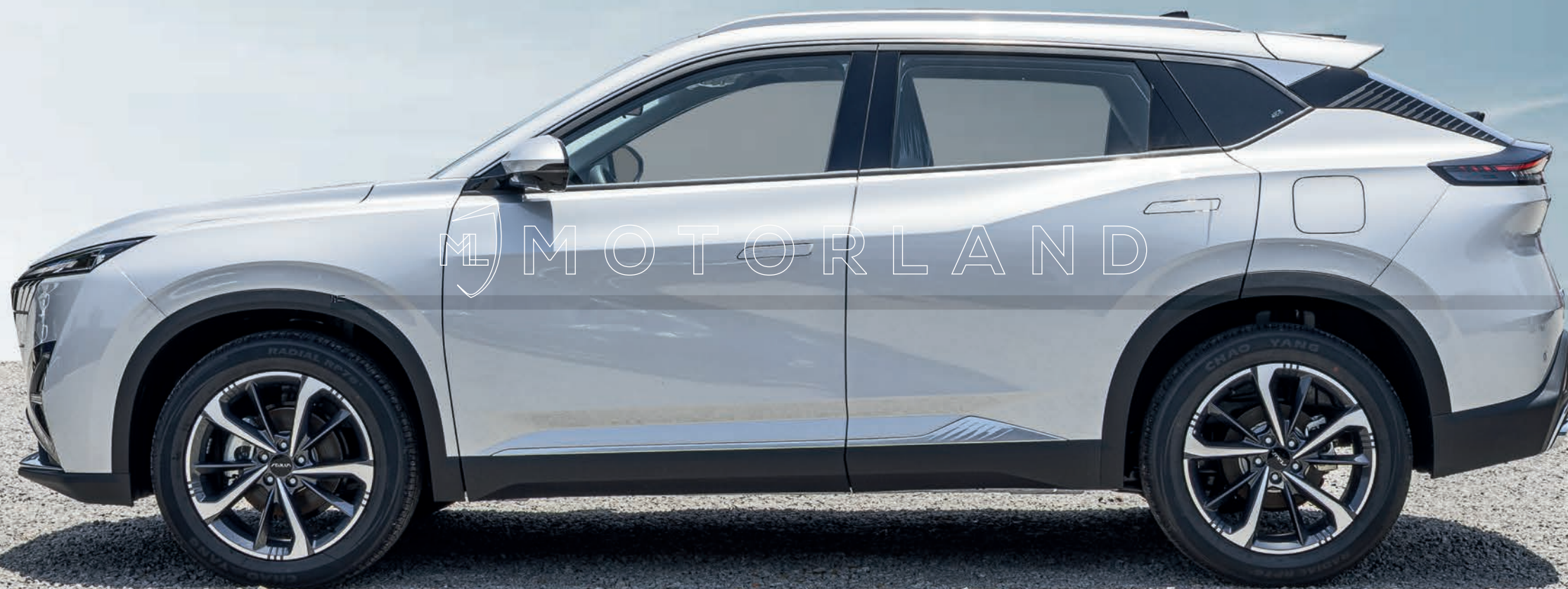
Vue de profil