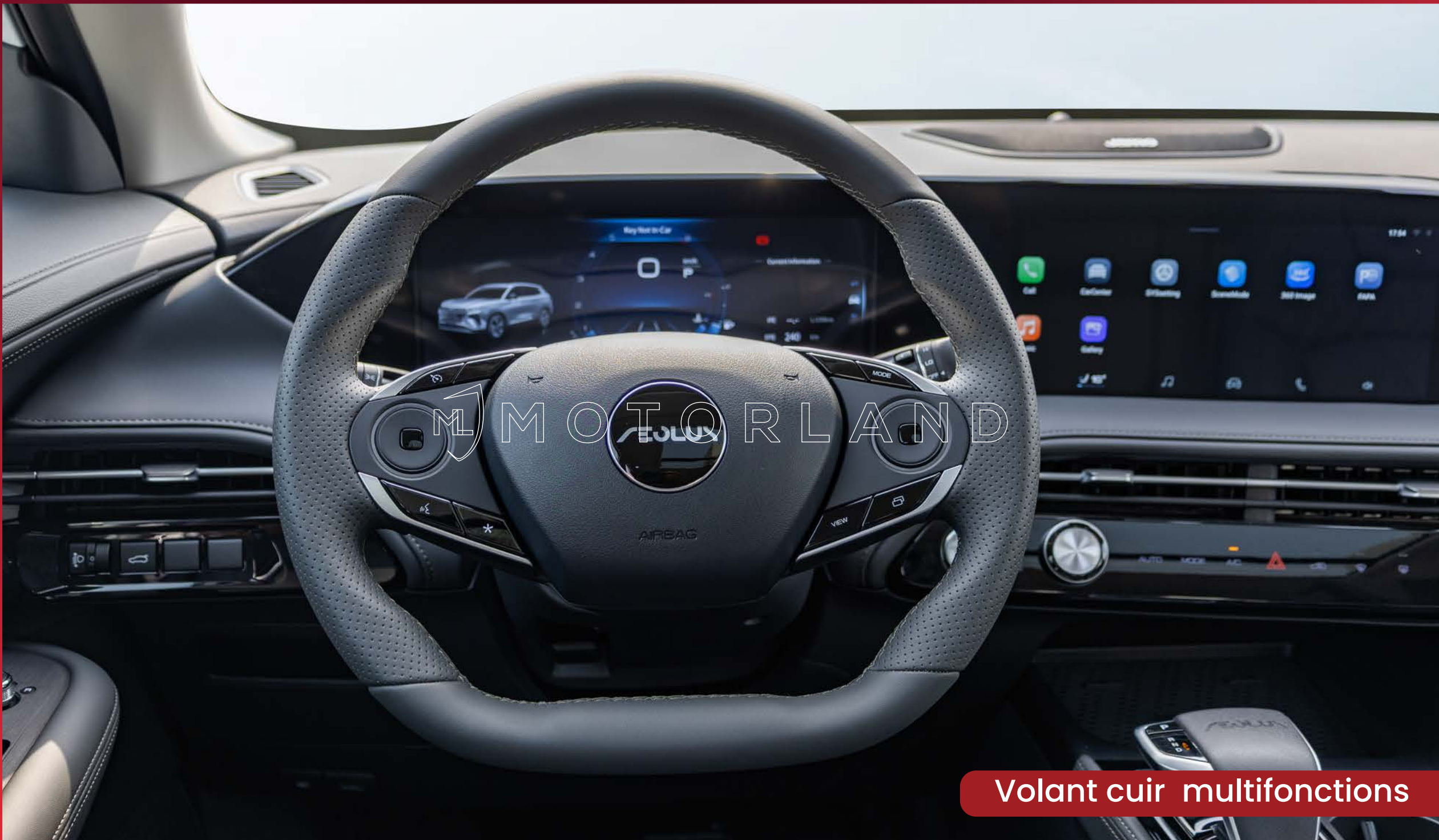
Volant cuir multifonctions