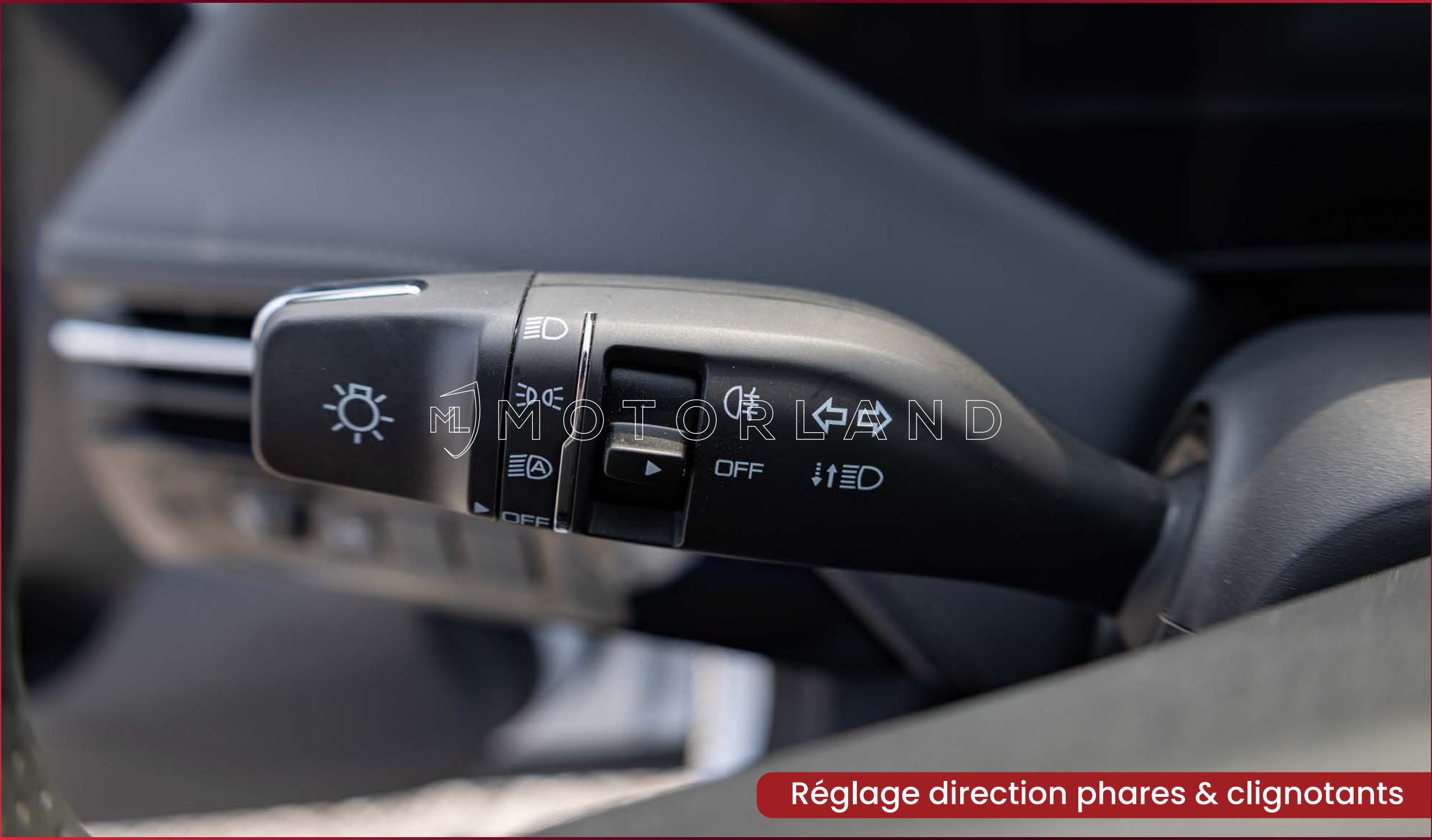
Réglage direction phares & clignotants