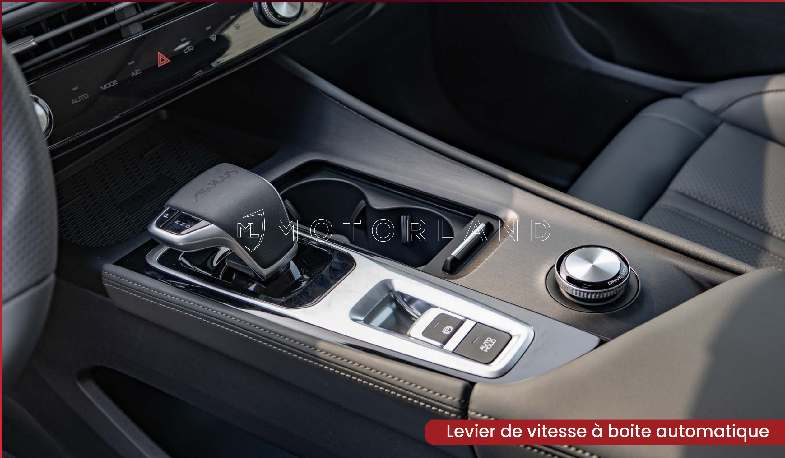
Levier de vitesse à boîte automatique