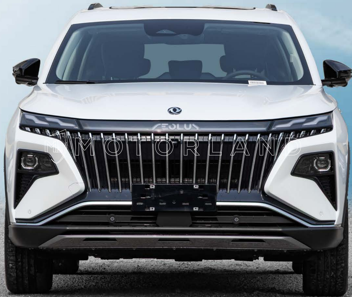
Vue de face