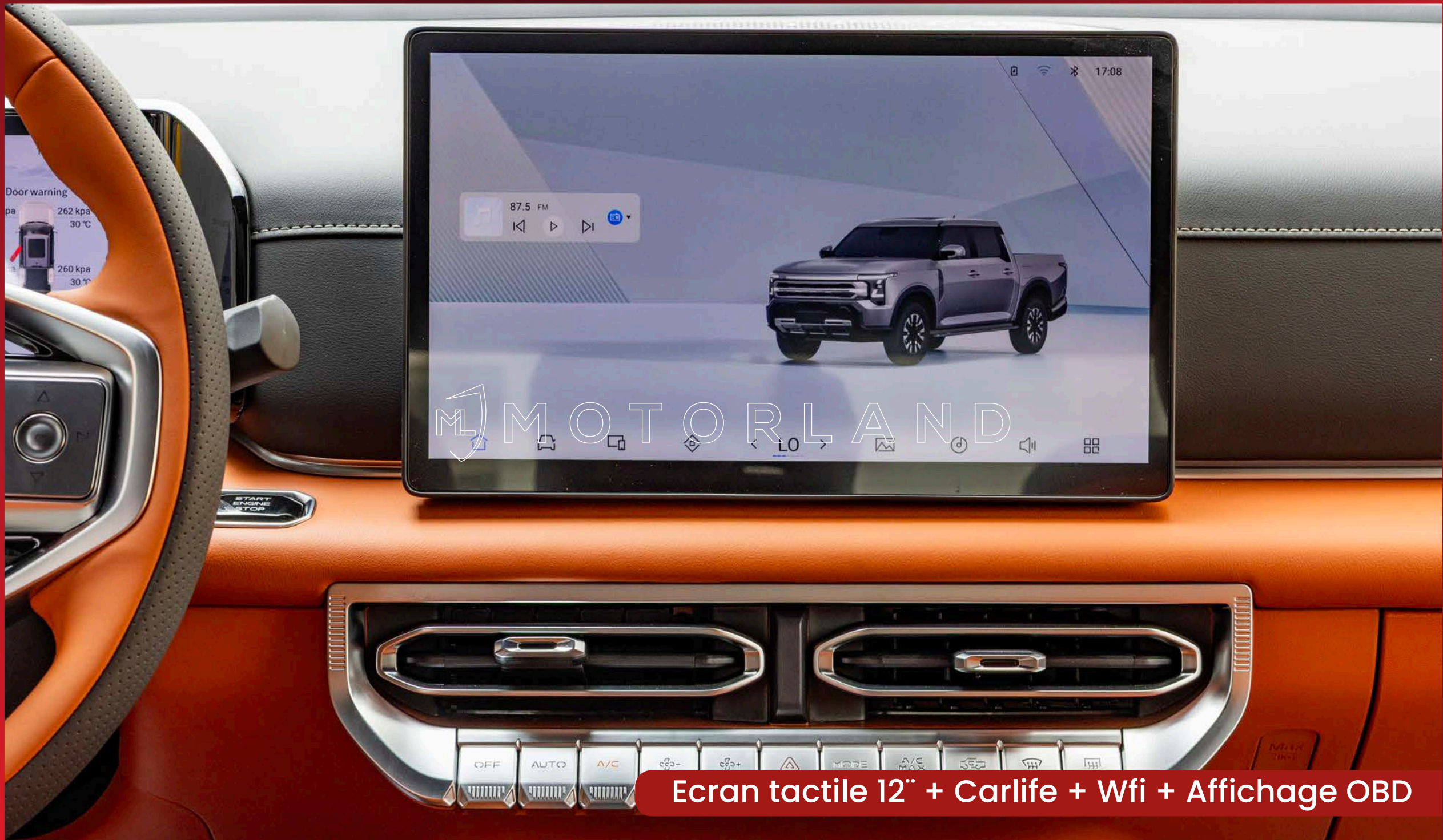
Ecran tactile 12" + Carlife + Wfi + Affichage OBD