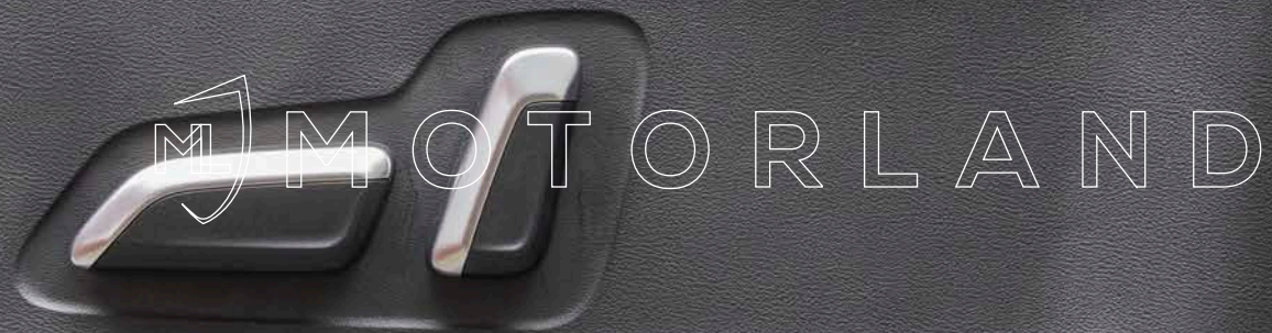
Réglage électrique siège conducteur/passager