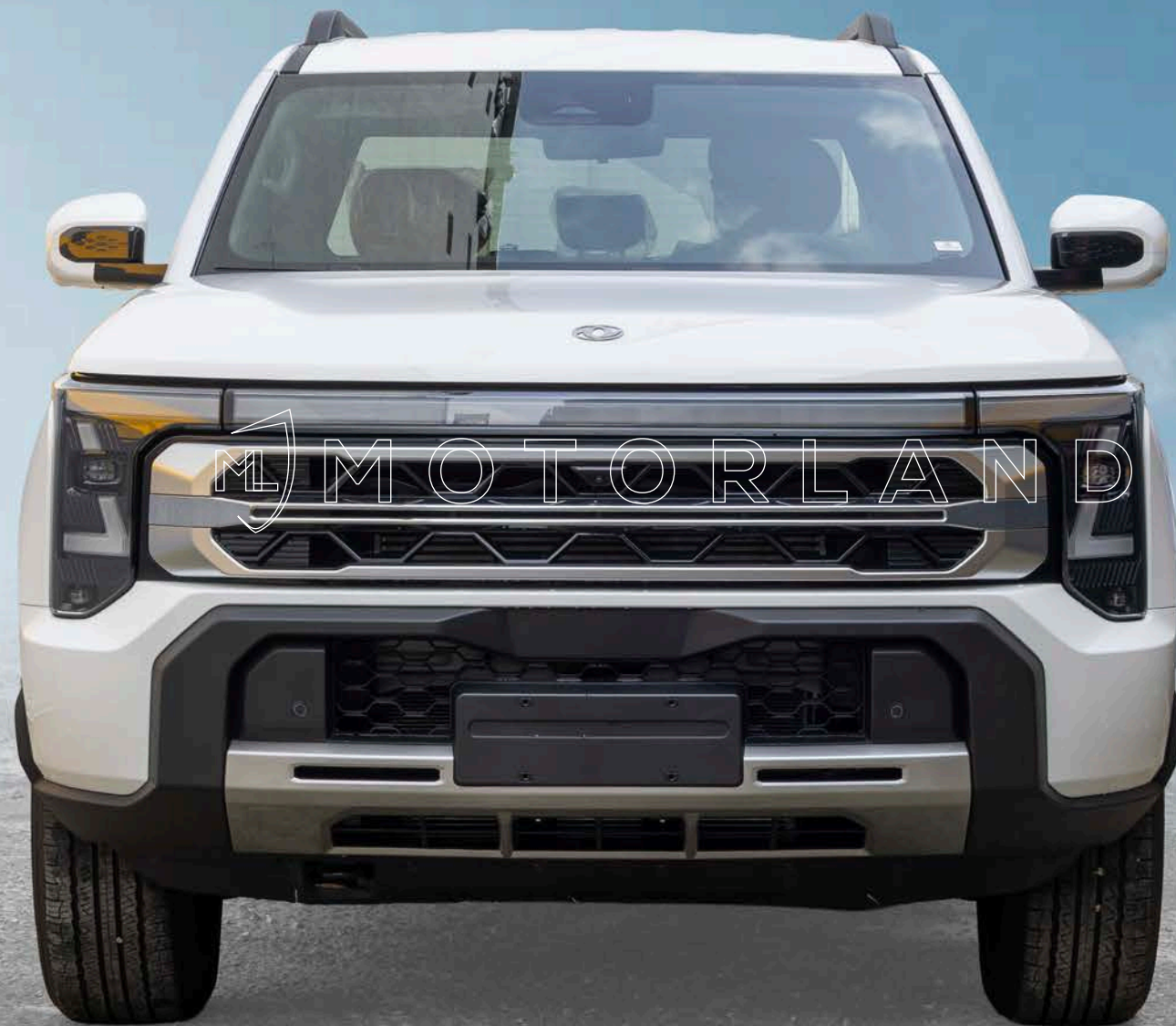
Vue de face