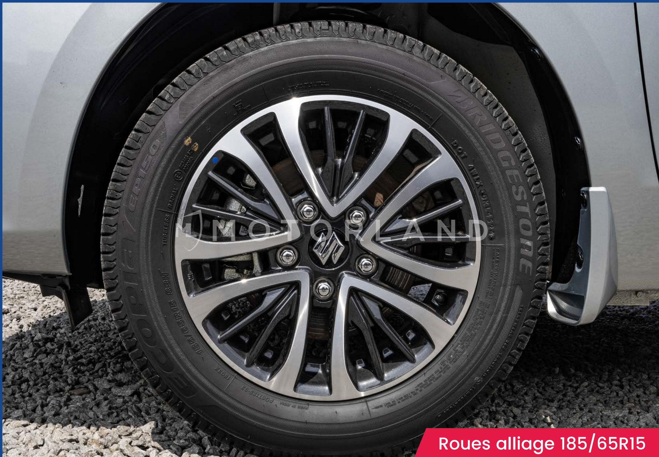
Roues alliage 185/65R15