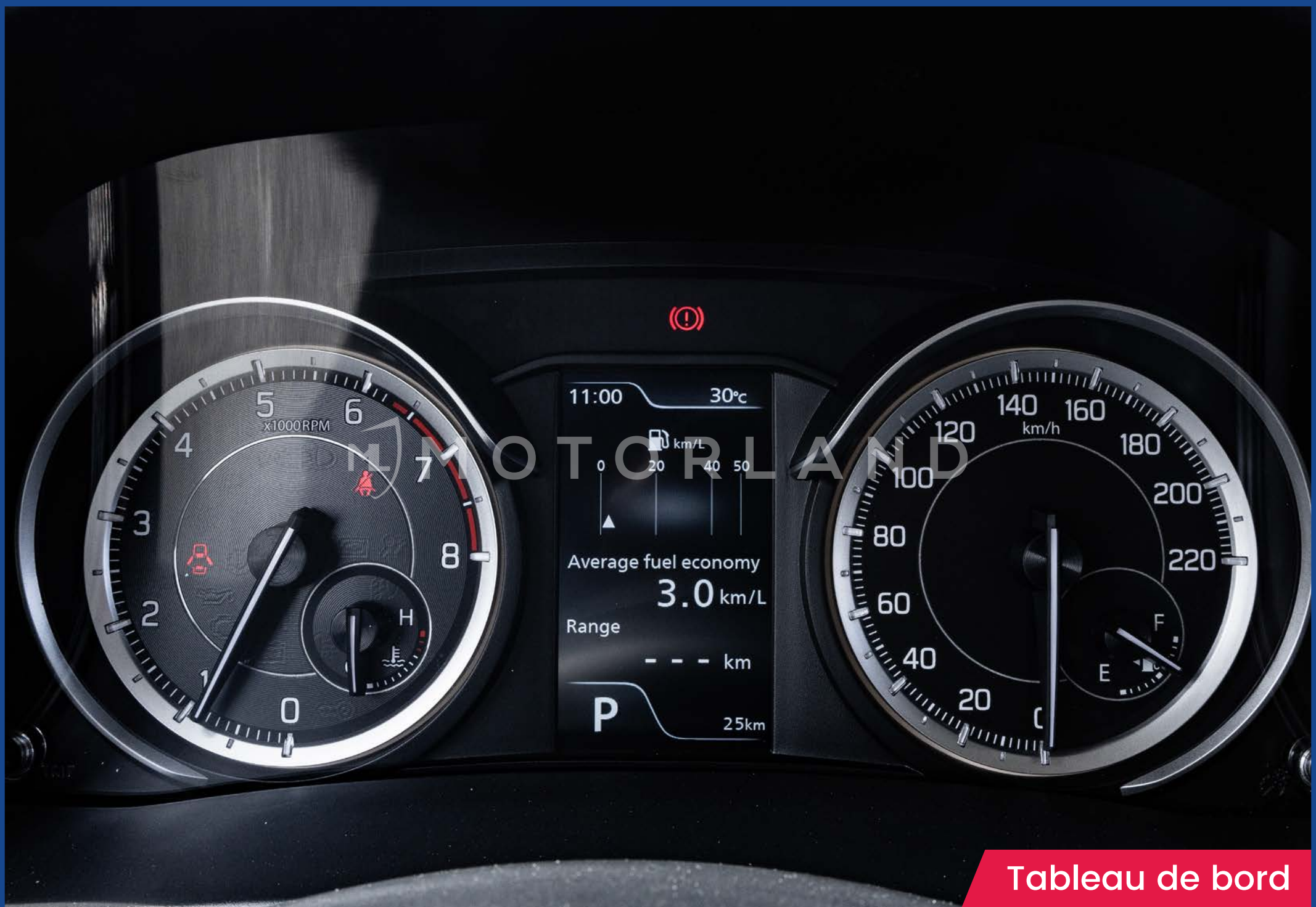
Tableau de bord