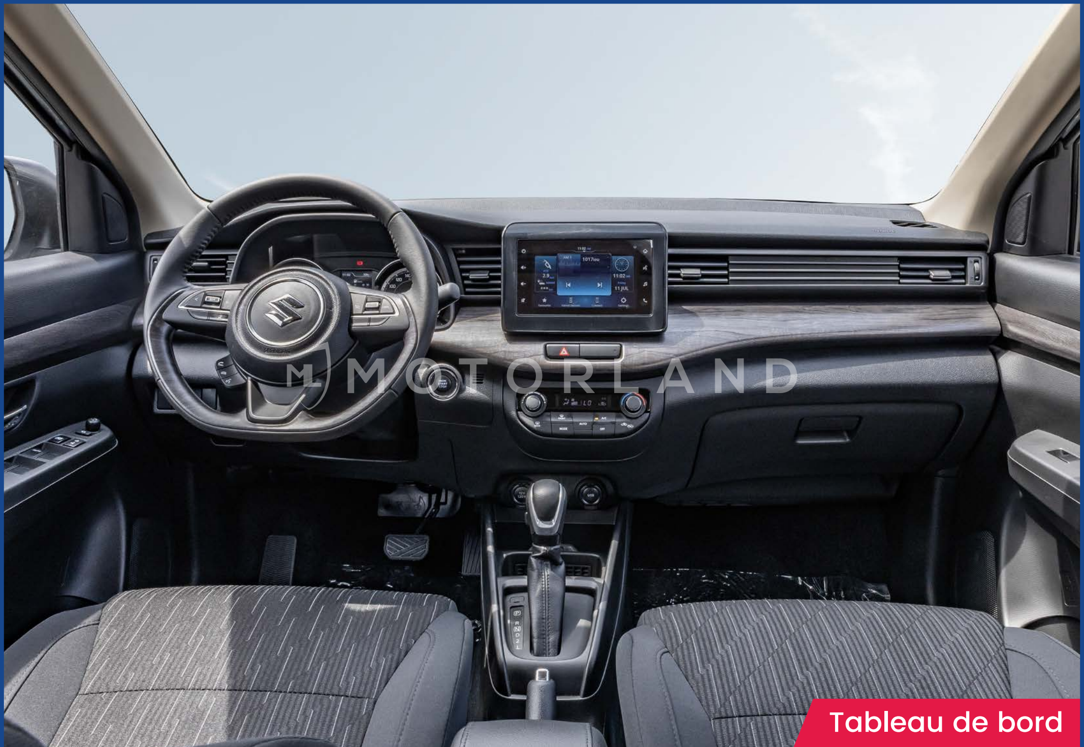
Tableau de bord