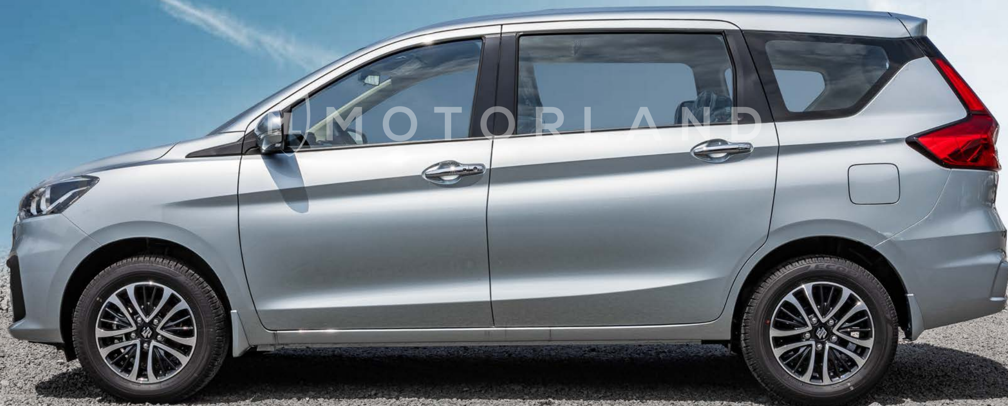
Vue de profil