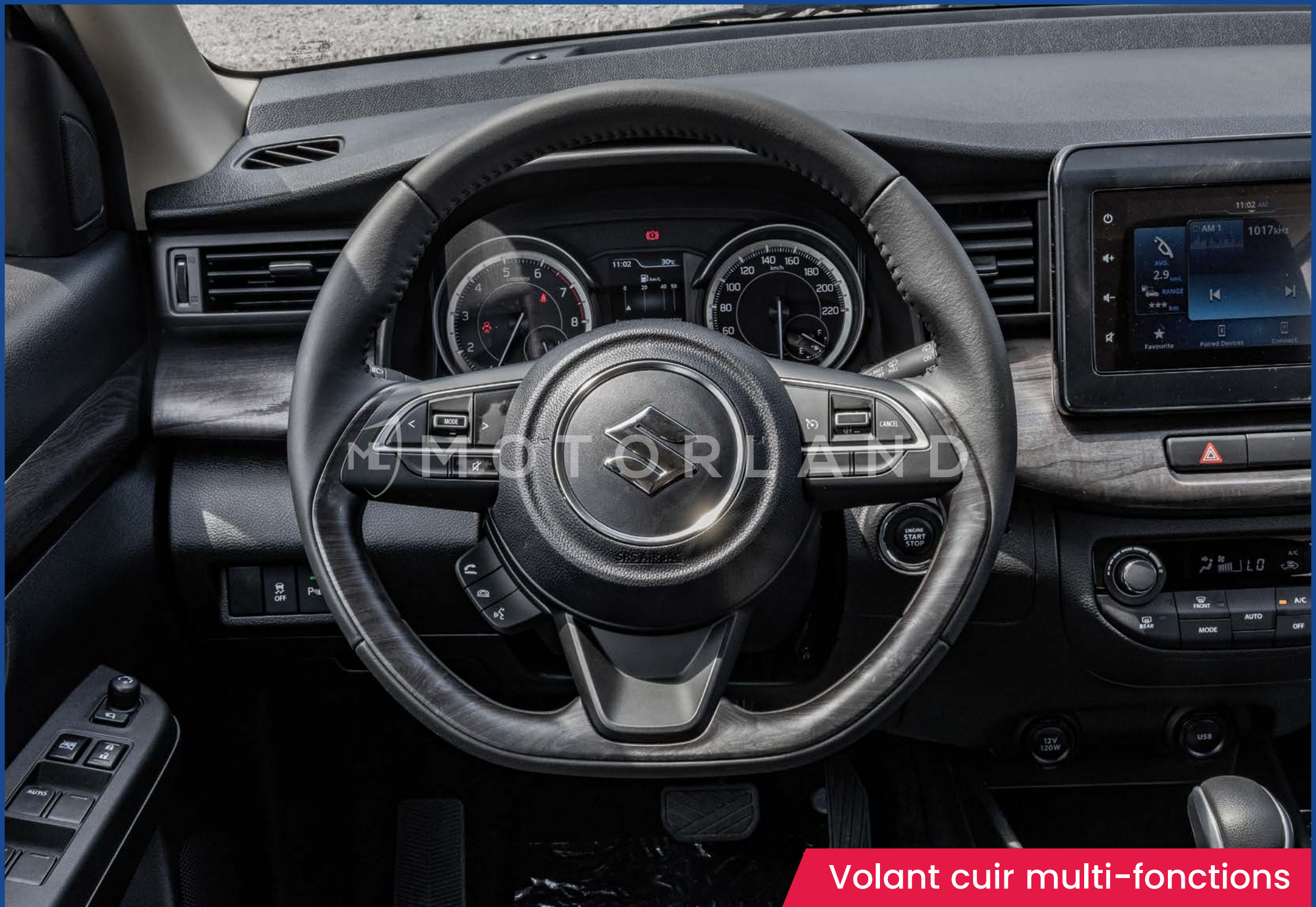
Volant cuir multi-fonctions